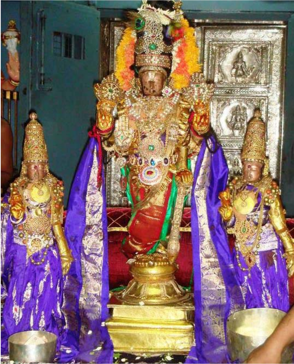
"Sriman nArAyaNan is upAdAna and upAdeya vastu!" SrI PerarulAlan with nAcchimAr - Thirukkacchi