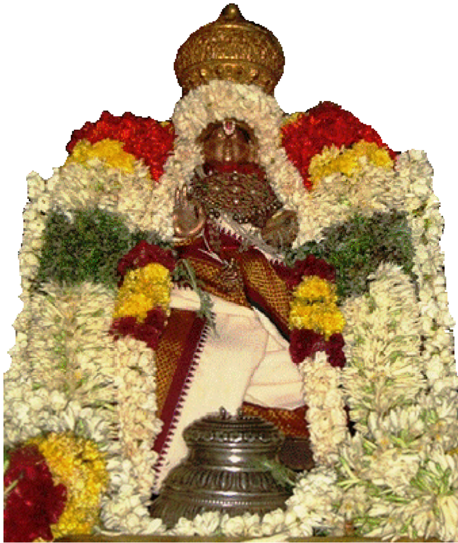
Swami Desikan - ThiruppullANi