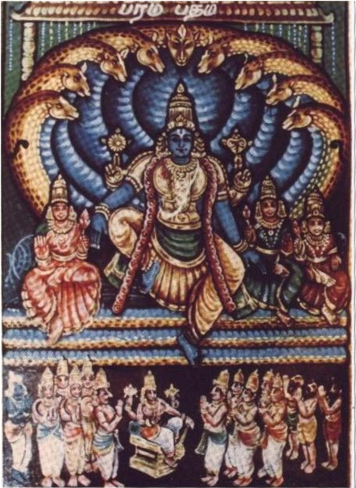
SrI VaikuNTham is made up of Suddha sattvam