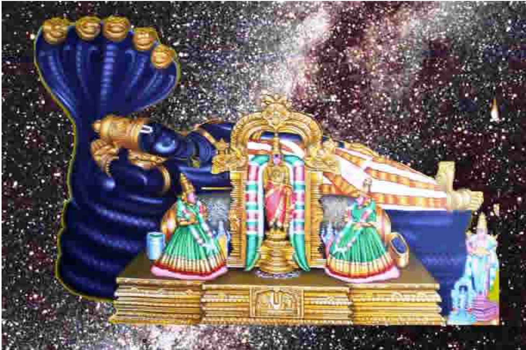
antar-bahisca vyApti of SrIman NArAyaNan!