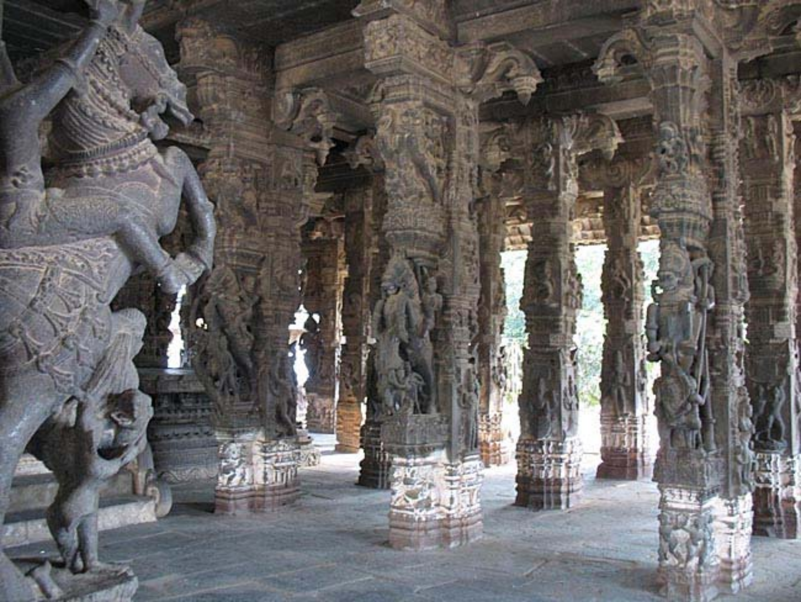
100 pillar ManTapam at Kanchipuram

Salutations to the One, who received the MahA prasAdam of Swamy NammAzhvAr's gifts!