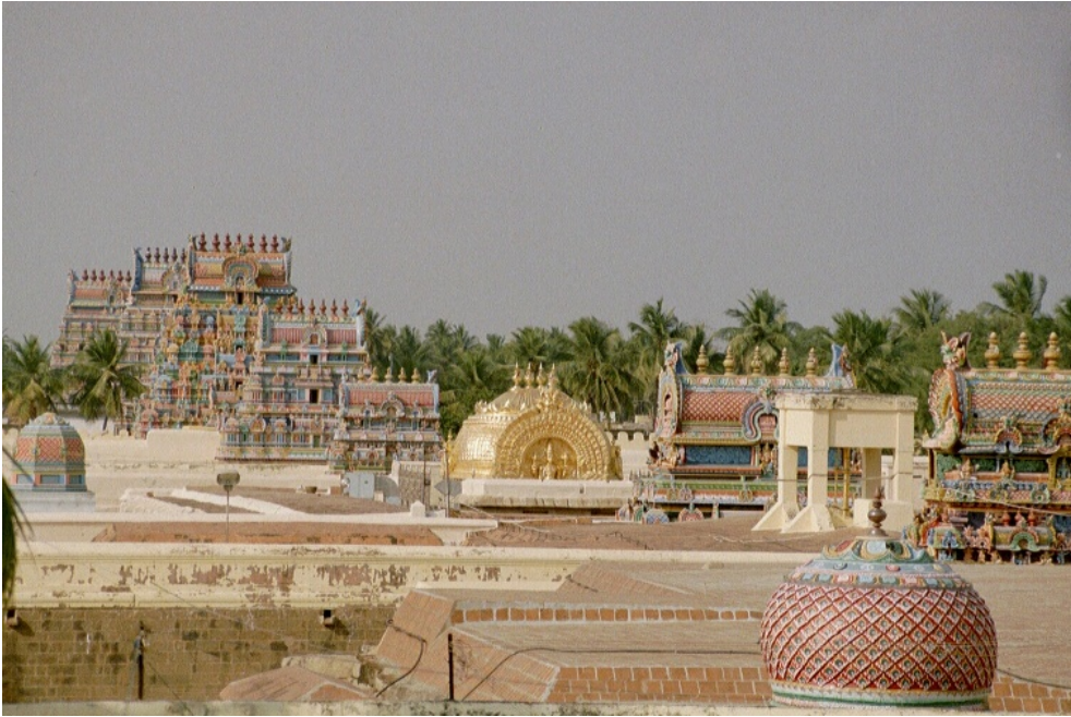
The Many gopurams of SrIranganAtha temple, SrIrangam

Salutations to the One, who repaired the prAkArams built by Tirumangai Mannan following the command of SrI RanganAthan!