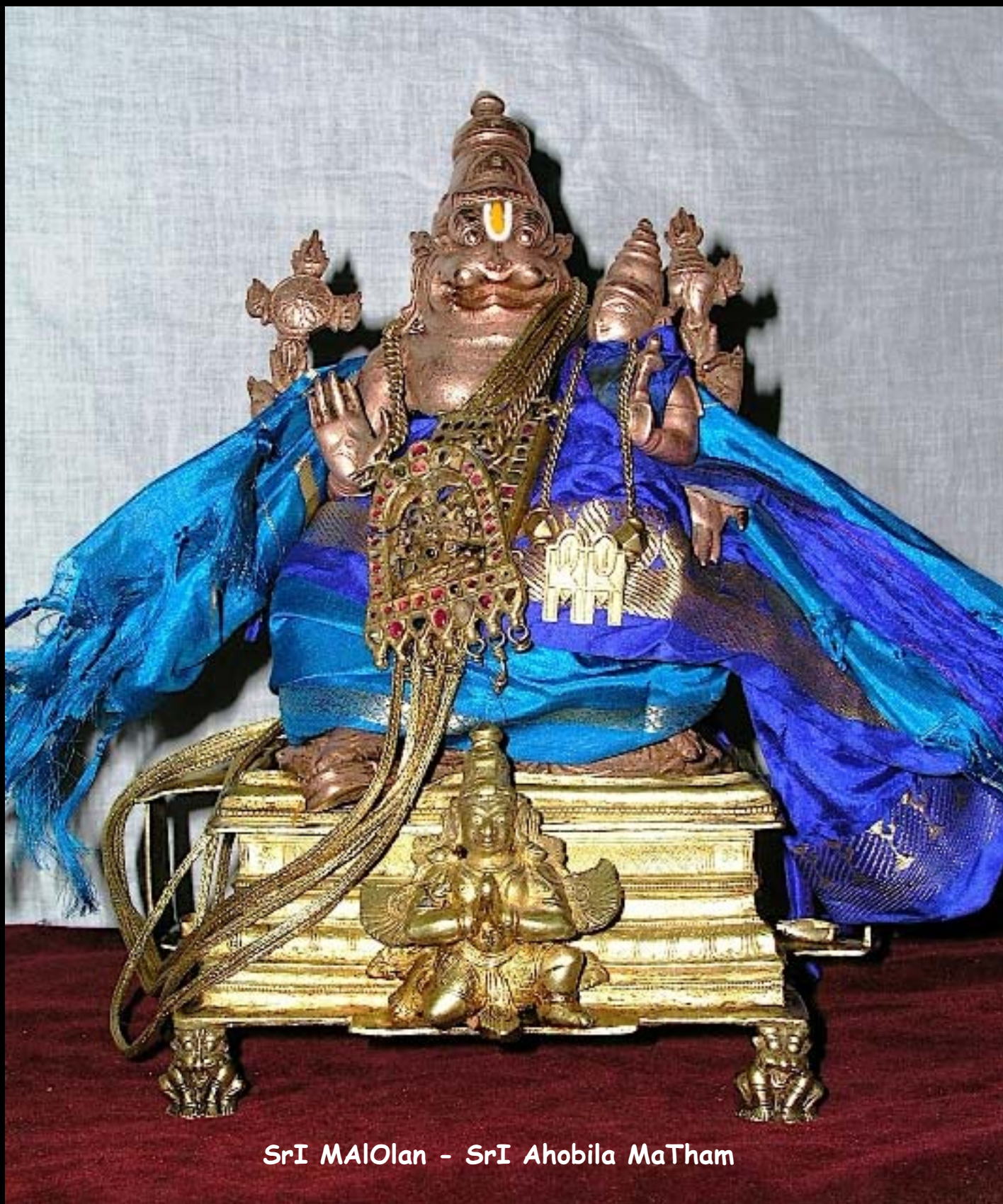
SrI MAIOlan - SrI Ahobila MaTham