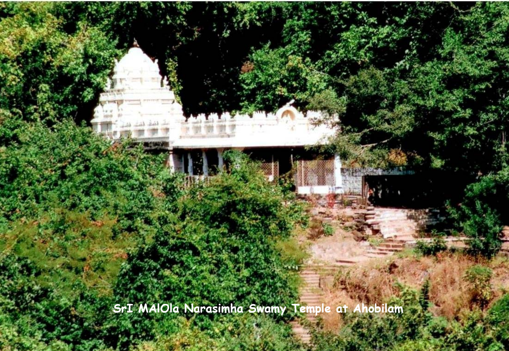
SrI MAIOla Narasimha Swamy Temple at Ahobilam

samaSrayaNam means generally "approaching an AcAryan".