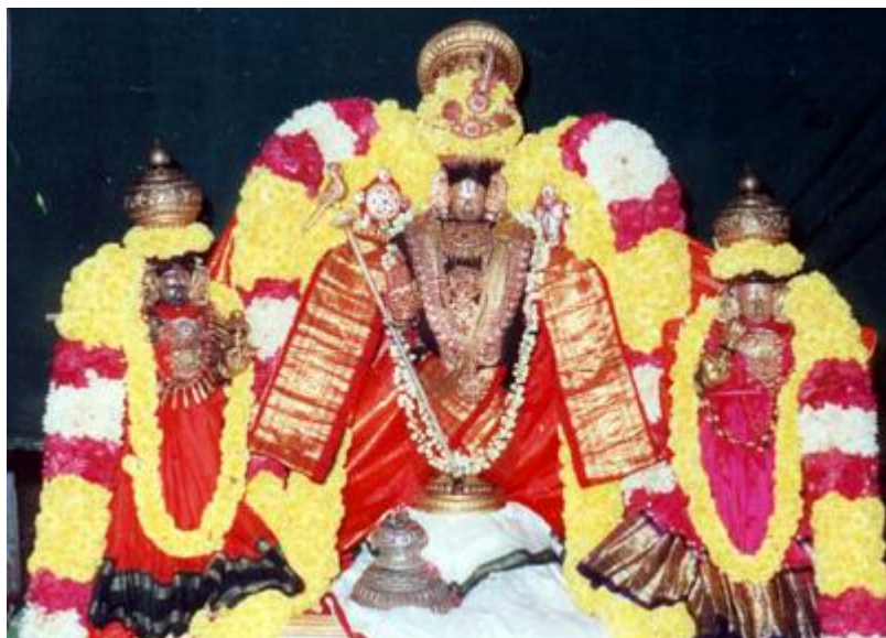
Adhi Thiruvarangam Ranganaayaki Thaayar with Perumal

MahAlakshmi stays united with Her Lord, Sriya: Pathi in an inseparable manner just as the rasmi (lustre) of Sooryan is inseparable from it and just as the waves are inseparable from the Ocean.