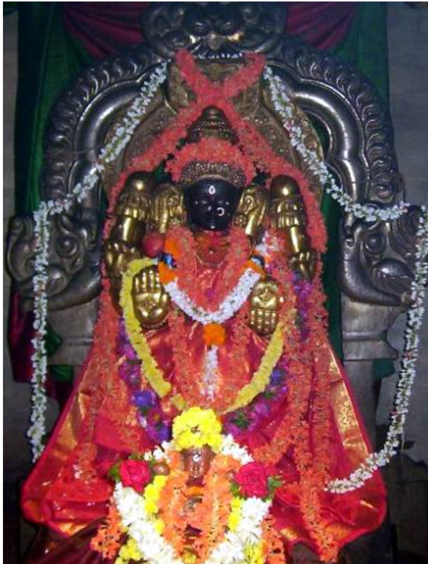
“Madhyarangam Ranganaayaki Thaayar– Karnataka”

If PerumAl incarnates as a Devan, MahA Lakshmi, His consort will incarnate as Deva SthrI. If PerumAL incarnates as a human, she will take an anuroopam as a human lady. PerumAL -PirAtti sambhandham is thus inseparable and well matched.