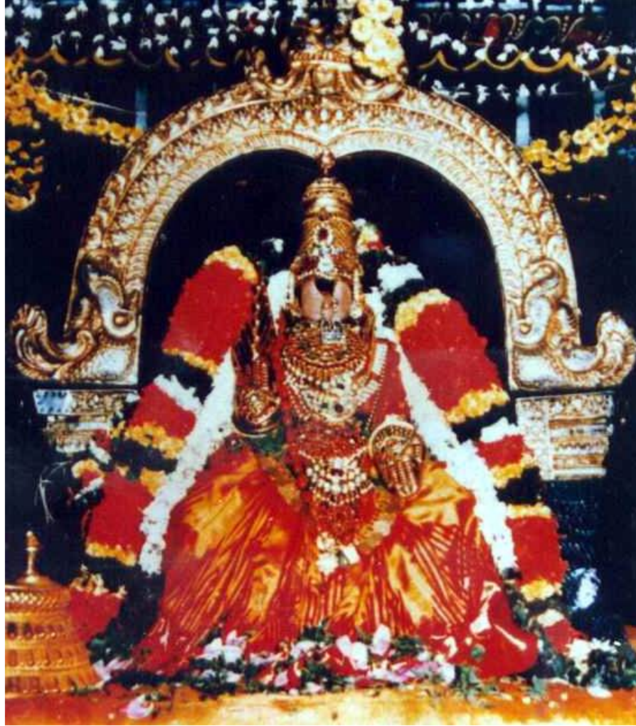
“Ranganaayaki Thaayar– Utsavar”

antagonistic to BhakthAs). Sri RanganAyaki is recognized as “JanArdhana Jeevika”, the life-giving creeper of Her Lord. She removes His aayAsams (fatigue/KaLaippu) and restores Him back to His erstwhile joyous state. She is like a moolikai for Him; she is the Rangaraja Jeevana Oushadhi. Her charm and beauty is natural (SvabhAva Ramyam) and the adorning of the beautiful jewelry (Sundara AabharaNams) makes Her appear like a Kalpaka Creeper in bloom. The aabharaNams add to Her natural beauty and enhance Her natural beauty like the sweetness of milk enriched by the addition of Sugar.