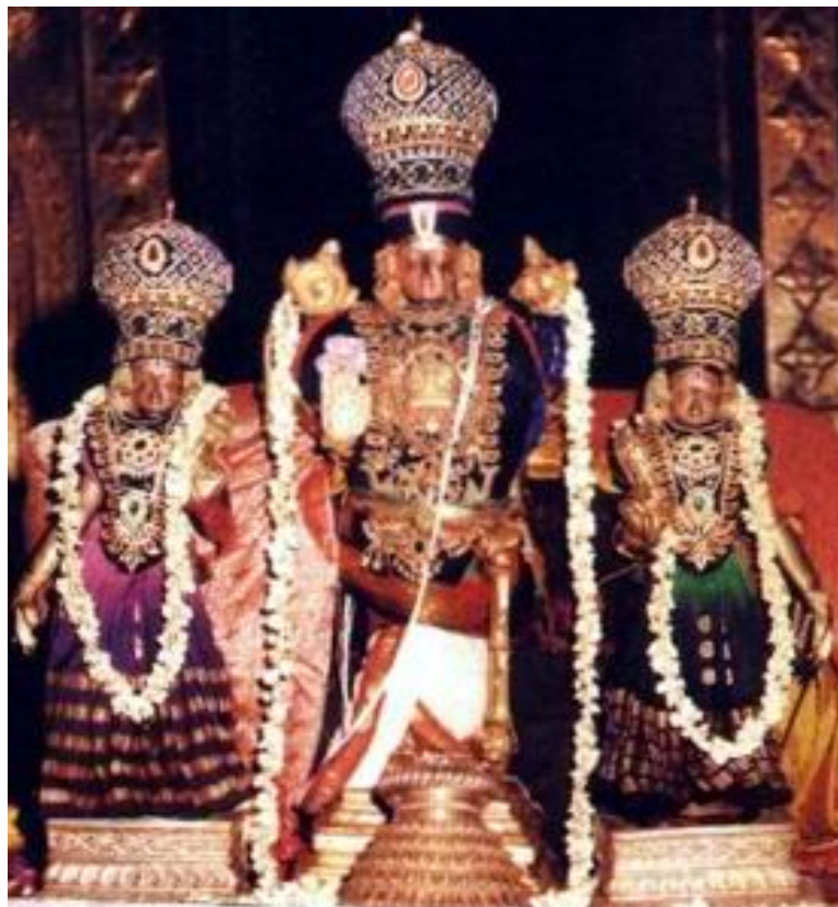
“Thiruindallur Ranganaayaki Thaayar with Perumal”

such as the SeethAvathAram. All of those displays seem to be abhyAsam (rehearsals) for the ArchAvathAram as Sri Ranga Naayaki, when they reach their peak.