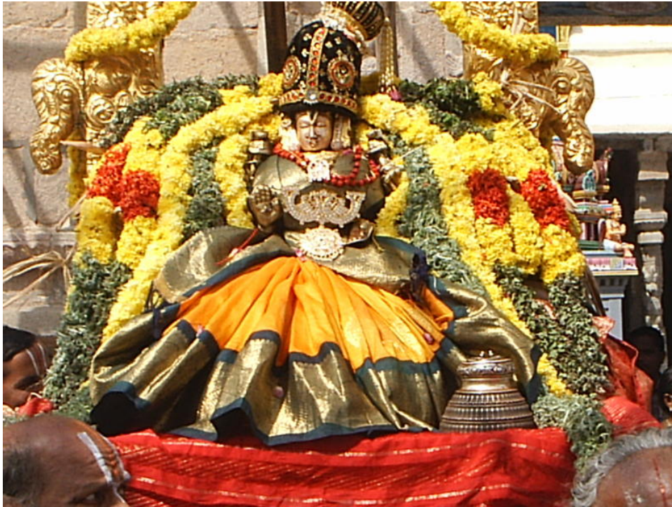
Vinaitheerkkum Thaayaar– Thiruchcherai

Sri RanganAyaki's SvaroopA, Roopa, GuNa, Isvaryams are thus celebrated and Sri RanganAyakan gets elevated through His Sambhandham with Her.