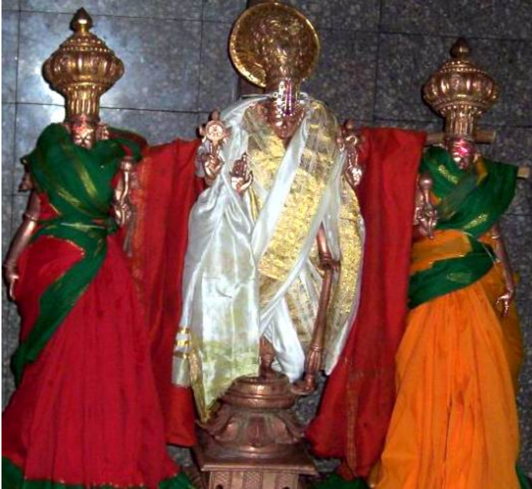
“Rangastala Sri Ranganaayaki Sametha Sri Ranganaathar”

Sri ParAsara Bhattar addresses the divine consort of Sri RanganAyaki as “Mukundhan” in this verse of Sri GuNa Rathna kOsam. This sacred name is the 518 th naamam in Sri Vishnu Sahasra Naamam for which Bhattar wrote a lengthy commentary known as “Bhagavath GuNa DarpaNam”. There, Bhattar comments that the name Mukundhan symbolises the One and only Salvation grantor (Moksha PradhAyakan). He explains that the name Mukundhan is arrived at from the union of two words, “Mukthim+ dhadhAathi” under the grammatical rule known as PrishOdhaara, which permits unusual combination of words outside normal rules of Grammar. It appears that there is a union here between Sri GuNa Rathnam of Sri RanganAyaki and Bhagavath GuNa DarpaNam of Lord RanganAthan.