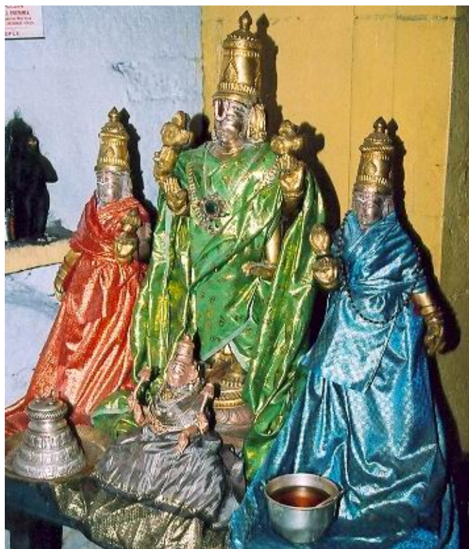
“Thirupaarkadal Ranganayaki Thaayar”

Such indeed is the anjali Vaibhavam that makes even Sri RanganAyaki blush that She has not done enough for one who holds anjali mudhrA in front of Her.