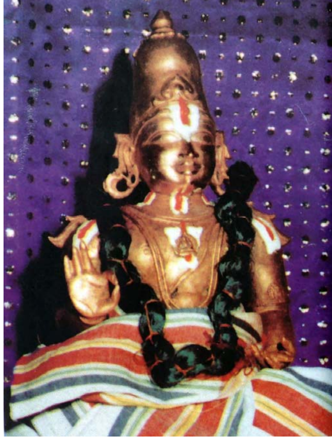
“Sri Paraasara Bhattar”

This Taniyan is from the Sri VishNu Sahasra naama BhAshyam of ParAsara Bhattar.