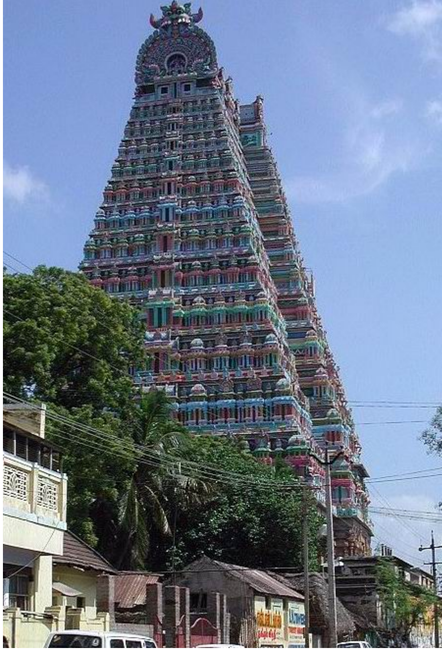
“Ranganaayaki Thayar’s Ranga Bhumi, Sreerangam”

SrIranga dhAmani mOdhasE (You revel at this abode of SrIrangam) now. This is the wonder (adhisayathvam) of the archAvathAram of SrI RanganAyaki at Sreerangam according to Swamy ParAsara Bhattar.