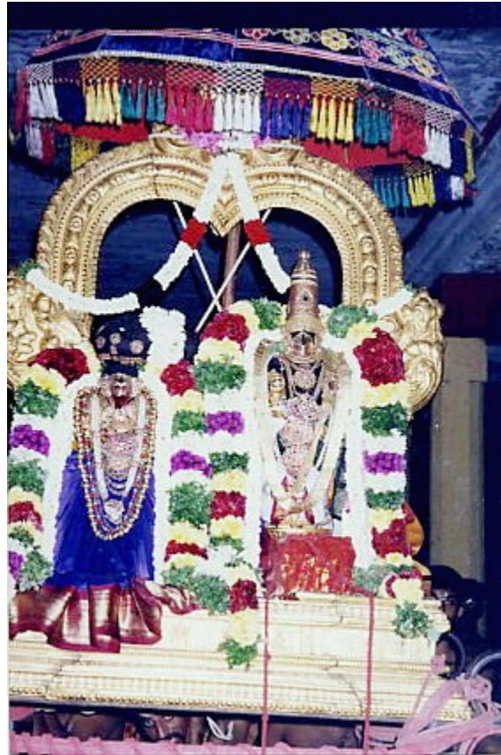
Sri Deivanayagan with Sri Varamangai Thayar

The chEthanam gets enchanted by the MaayA of their Lord and forget their svaroopam as Dasans for the Lord and fail to enjoy His Swamithvam and His anavadhikAdhisaya aanandha Svaroopam (His nature of boundless Beatitude). Sri RanganAyaki is intrigued and amused by the power of Her Lord's MaayA. She is relieved, how ever, when Her Lord teaches the chEthanms as how to free themselves from His powerful MaayA. He points out: “ MayyEva yE prapadhyanthE MaayAmEthAm taranthi tE ”. Those who take refuge in Me alone shall pass beyond this MaayA of Mine consisting of the three guNAs.