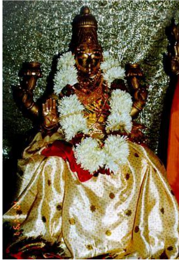
“Ranganaayaki Thaayar– Pomona, New York”

Her Oujvallyam (Radiance) and divine fragrance (Sougandhyam). Her Generosity (UdhAra SvabhAvam), nobility (Urjitham), Power to grant all the desired boons (sarvAbhIshta Prathathvam) and more auspicious attributes are suggested by Her Dhivya MangaLa vighram and defies any through description (VaachAm agOcharam) by mere words.