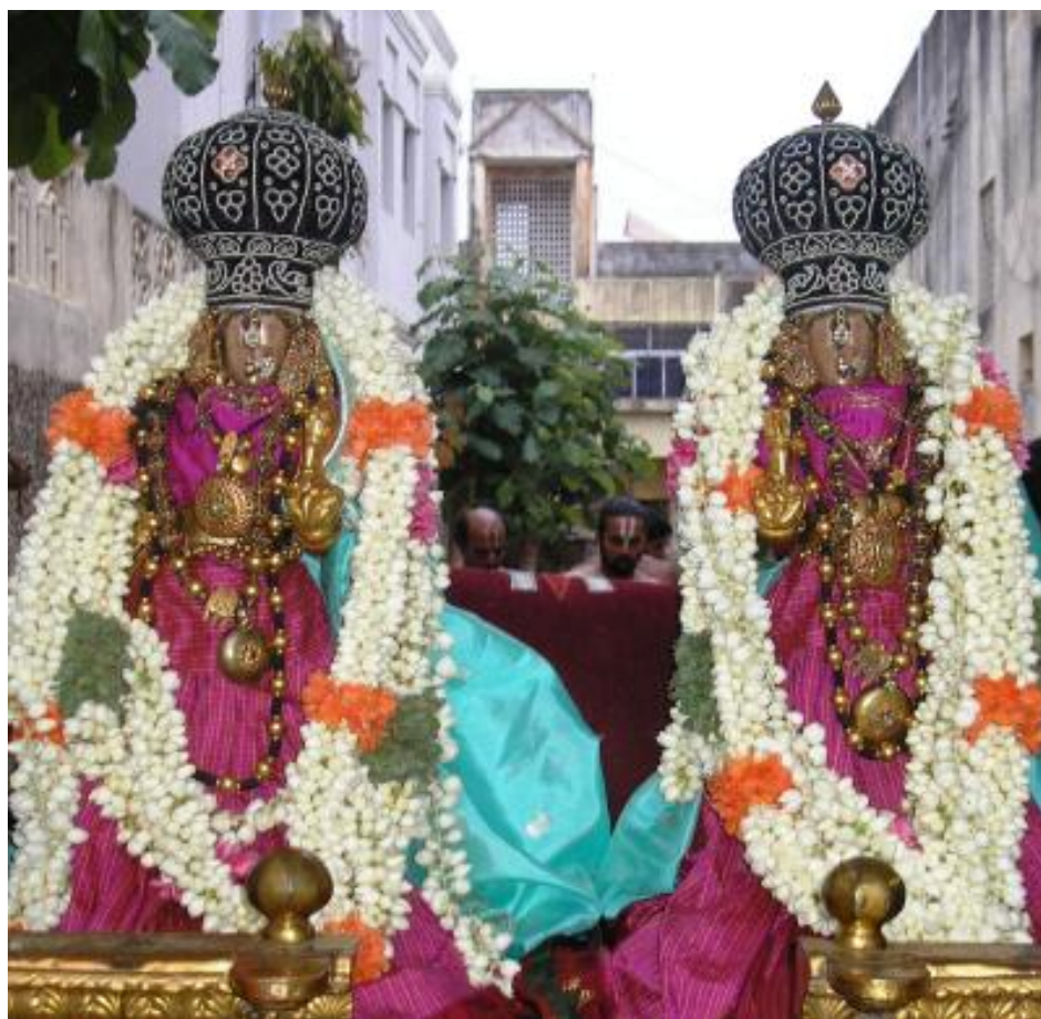
Ubhayanaachiyaars– Parthasarathy Koil

Similar is the counsel of Vedams and other PoorvAchAryAs!