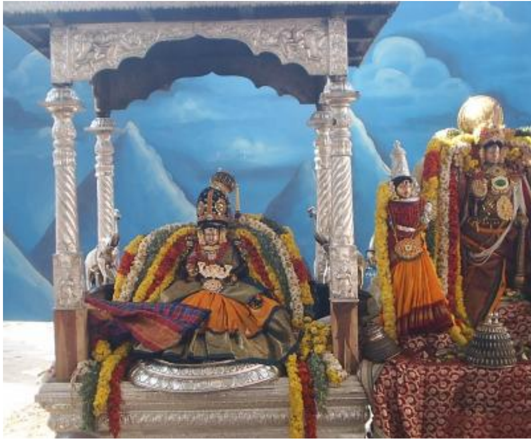
Thiruchcherai Saaranayaki Thayar

reputation of total independence (Svaroopam SvAtantryam Bhagavatha:) that is characteristic of (His) top supremacy, which however, is only a result of, and which can be understood only on that basis of being Your Consort. You and Your association are the determinant-factors for His Supremacy and independence. He cannot be known or defined or described or praised except by reference to you. He derives His greatness by reason of your connection, your continuous contiguity. This only means that You are the personification of, so to say, of the Qualities of Supremacy, Independence, and Total Sovereignty etc. This is exactly the reason for the VedAs not spelling you (Your GuNams) out distinctly --because You constitute His qualities (GuNams), which are indistinct and inseparable from Him! You-- His attributes-- are part of Him. You are in Him as His Qualities. Hence, when He is spoken of and when His qualities are understood, you are IPSO FACTO to be understood as the subject as much as He (Your Lord).