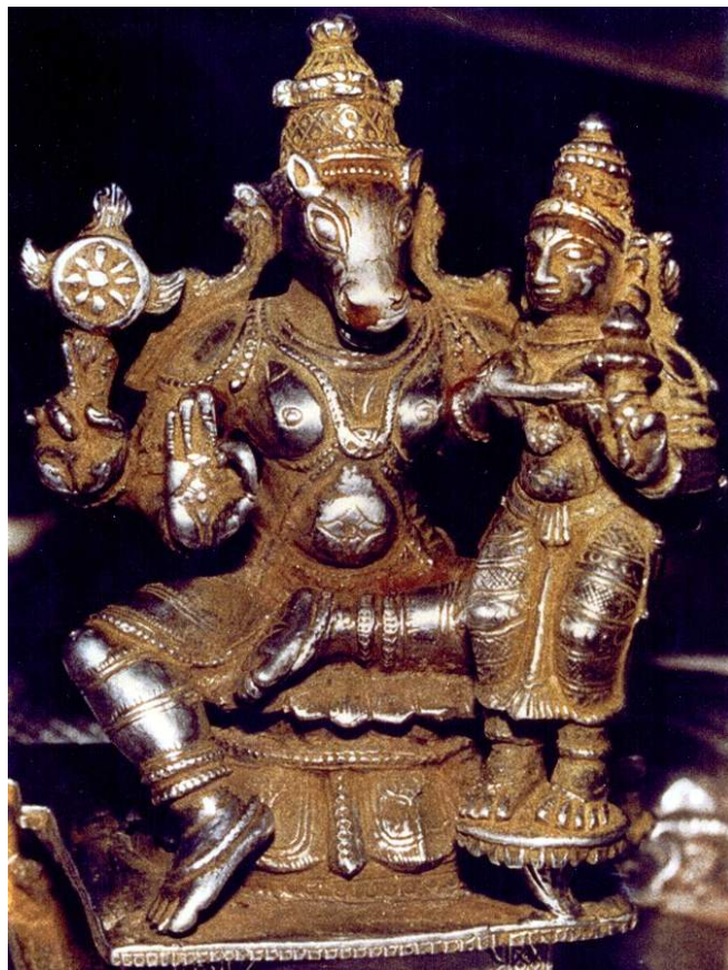
SrI ParakAlamaTam Lakshmi HayagrIvar during thirumanjanam

The Rg Vedic manthram section, "ChandramA manasO jaatha:-" (Rg Vedam-Canto X.90.13) has some connection to this anubhavam. The HayagrIva-ChandrOdhayam and its effect on the mind of the UpAsakan is alluded to here.