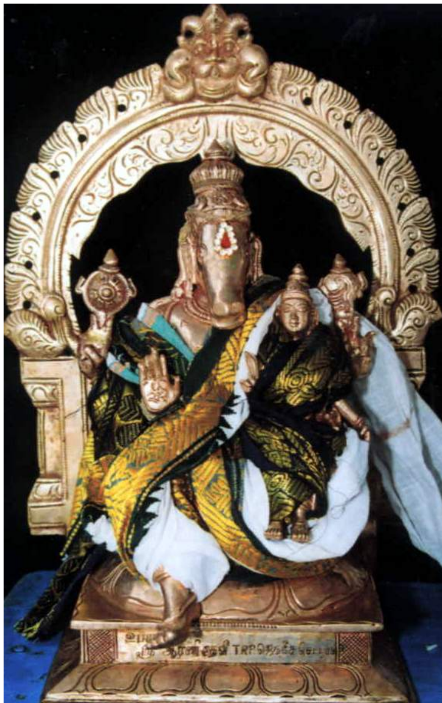
Adi Keshava Perumal Koil -Arani Hayagreevar