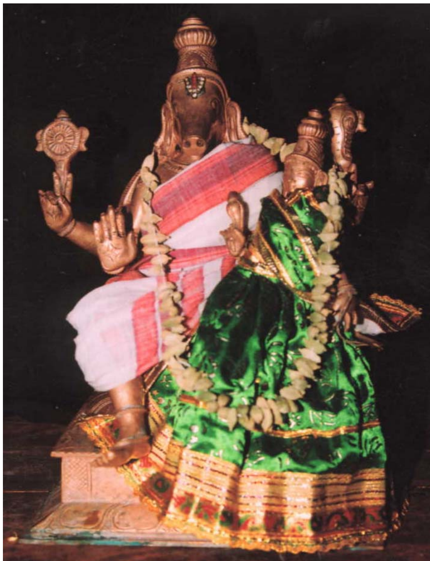
Medavakam Perumal Koil Sri Hayagreevar

Let us take up the meaning of the second paadham, “Laya: PrathyUhAnAm laharivithathi BhOdhajalatE:” now.