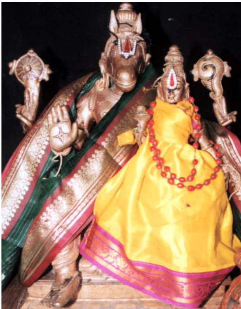
Kodanda Ramaswamy Temple, Nandambakkam - Hayagreevar