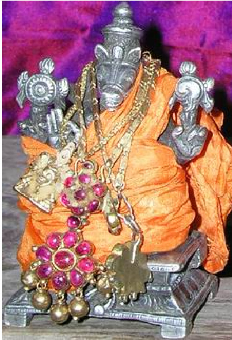
Sri HayagrIvar at Sri Ahobila Matam

This sIOkam recognizes that Lord HayagrIvan celebrated for His Vidhya dhAnam confers such blessings favorably on great rishis like VyAsA by His VeekshaNa vaibhavam (power of katAksham alone).