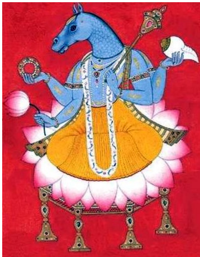
SrI HayagrIvar being worshipped (tAntrIka) by Tibetans