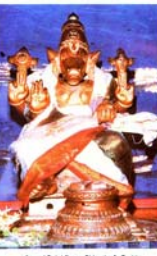
(Sri Hayagriva (Bhadra) Sahasra Naamam)