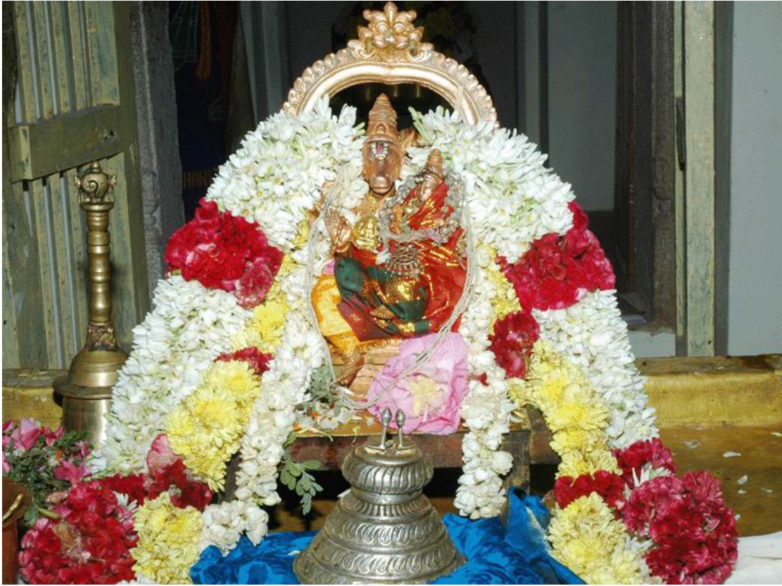
SrI HayagrIvar of SrIrangam SrImadANDavan Ashramam - ThiruppullAni

That Lord with “Manthramaya SarIram” accepts “akhaNda Saarai: HavishAM pradhAnai:” and distributes them to the DevAs and makes them happy and contented (vyOma-sadhAm aapyAyanam vidhathsE). Vyoma means aaakasam. VyOma Pureesan (Aakasa NagarIsan) is the name of ThiruviNNagarappan. VyOma sathAm means celestials (dEvAs). VyOma Pureesan is their Lord. He blesses them with gifts of tasteful Havis (akhaNda Saarai: HavishAM pradhAnai:). They are filled with paripUrNa thrupthi or complete contentment (AapyAyanam vidhathsE). Thus ends the beautiful salutation to the Yaj~na Moorthy, the embodiment of Veda manthrams.