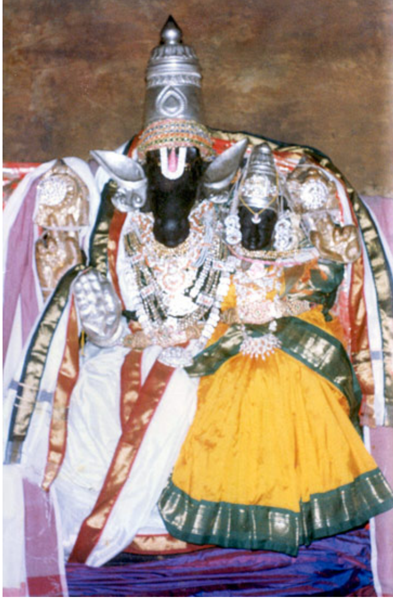
OushAdri – Moolavar with thAyAr

avathArasya sathyathvam ajahath svasvabhAvathA Suddha Saththvamayathvam cha SvEcchAmAthranidhAnathA Dharma glAnou samudhaya: Saadhu samraksdhANArTathA Ithi Janma rahasyam yO vEtthi naasya Punarbhaav: