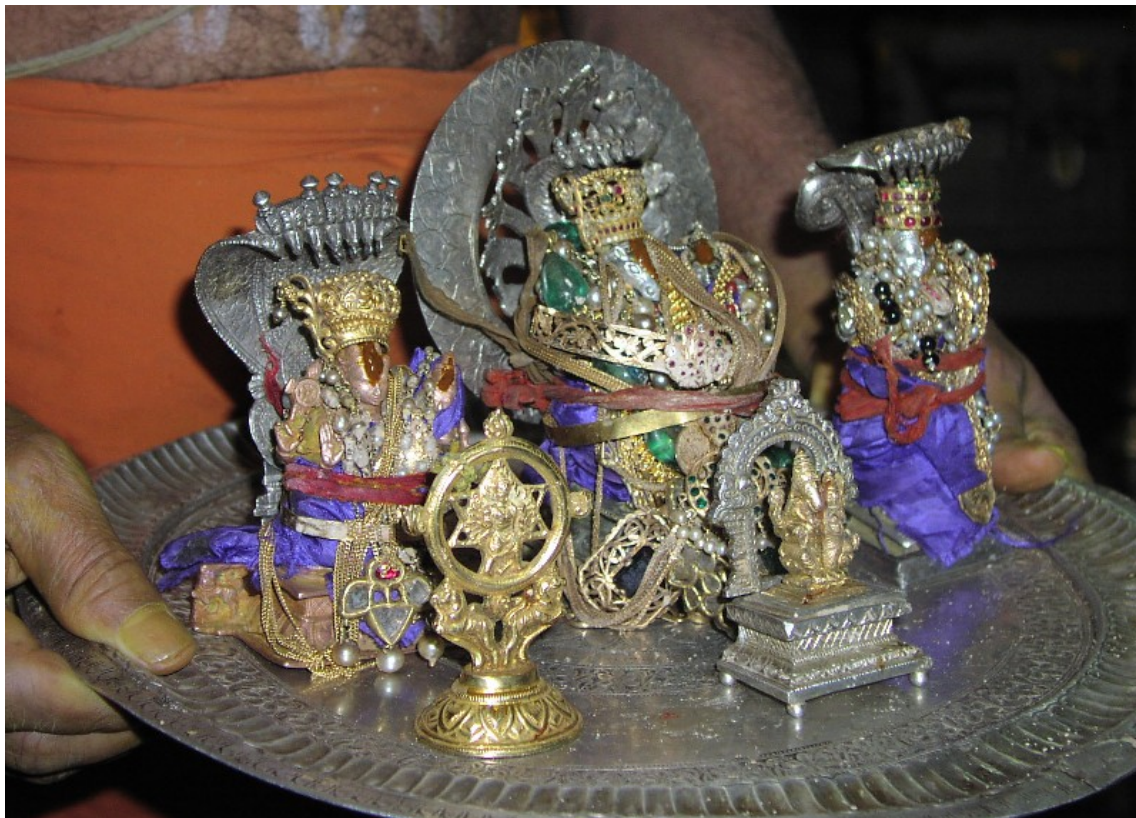
SrI ParakAlamaTam Lakshmi HayagrIvar

Thirumazhisai points out that DakshiNA Moorthy-Sivan was teaching these eminent sages the way in which He Himself worships His Lord and grandfather, Sriman NaarAyaNan with total devotion.