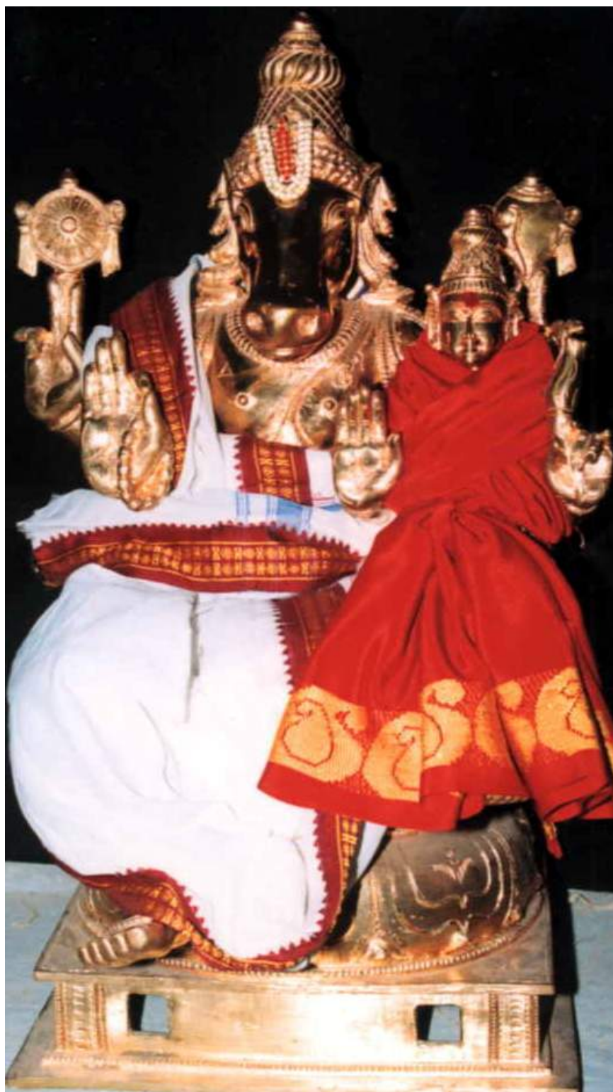
Arumpuliyur-Pazaya Sevaram Hayagreevar

presence of Lord HayagrIva on the tip of his tongue is essential and therefore he invites the Lord to sit on a throne that he sets up for Him there (JihvAgra SimhAsanam abhyupEyA:).