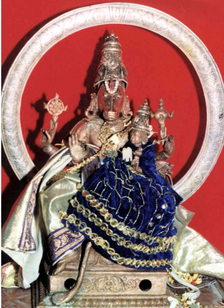
Paravakkottai SrImath Andavan Ashramam, Srirangam