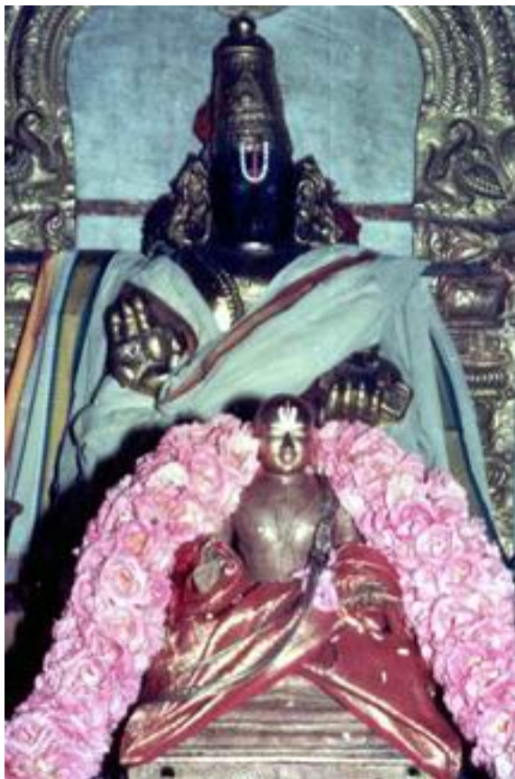
Sri HayagrIvar with Svami Desikan (ThiruvahIndrapuram)

Swamy Desikan was immensely happy with PakshirAjAn's blessing and began to perform Sri HayagrIva Manthra japam for many days. Lord HayagrIvan was so pleased with Swamy Desikan that He appeared before latter to grant the boons of unsurpassed Pravachana sakthi, visEsha Jn~Anam on para and apara vidhyais and power to defeat the opponents in adhyAthmika saasthra debates and to raise the vijaya dhvajam of Sri Bhagavath RaamAnuja Darsanam.