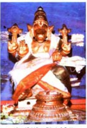
(Sri Hayagriva (Bhadra) Sahasra Naamam)