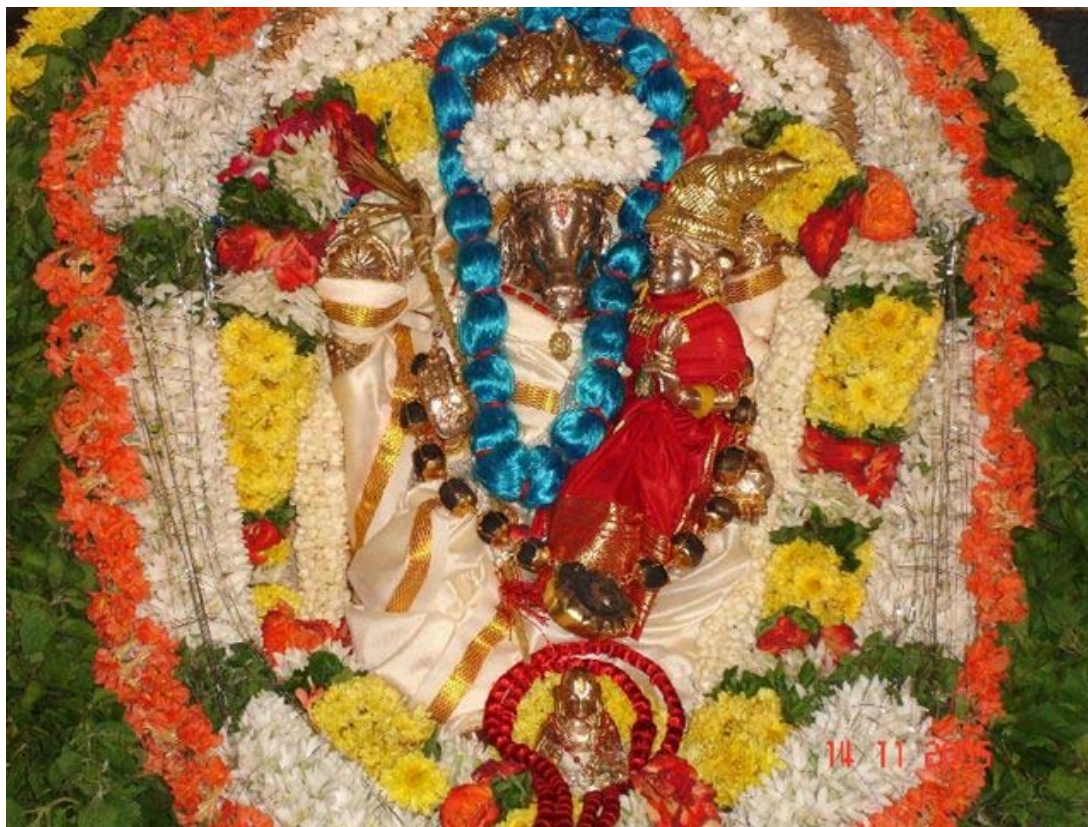
SrI HayagrIvar, recently installed in Vasanthapuram (Bangalore) temple (svAmi dESikan under the umbrella of SALagrAma mala)