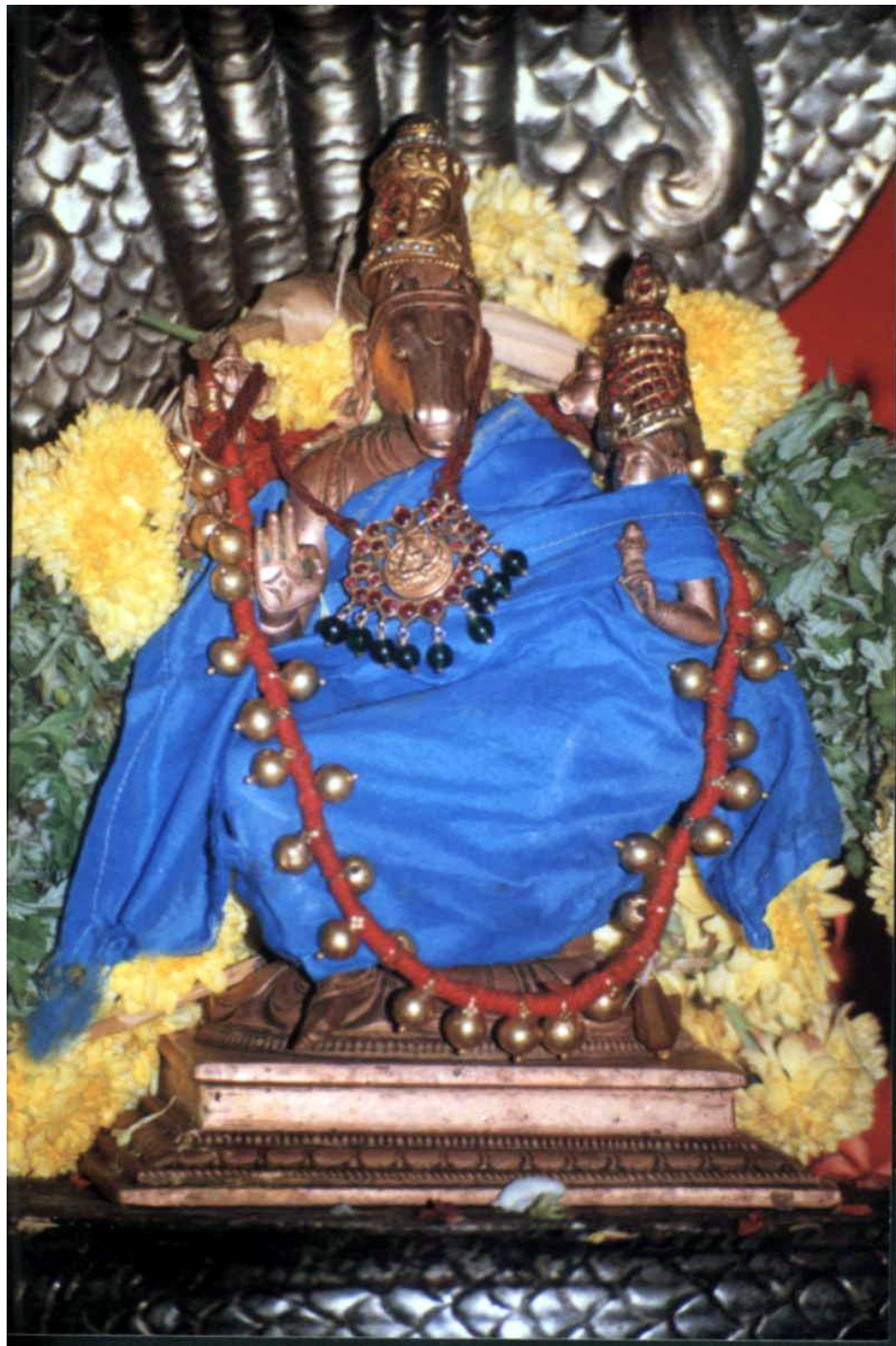
SrI HayagrIvan at Svami Desikan Sannidhi, Srirangam

“Visuddha Vig~yAna ghana SvarUpam Vig~yAna visrANana Bhaddha dhIksahm DayAnidhim dehabruthAm SaraNyam Devam HayagrIvam-aham prapadhyE”