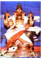
(Sri Hayagriva (Bhadra) Sahasra Naamam)