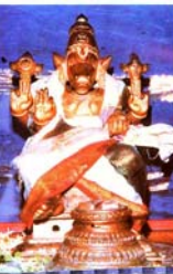
(Sri Hayagriva (Bhadra) Sahasra Naamam)