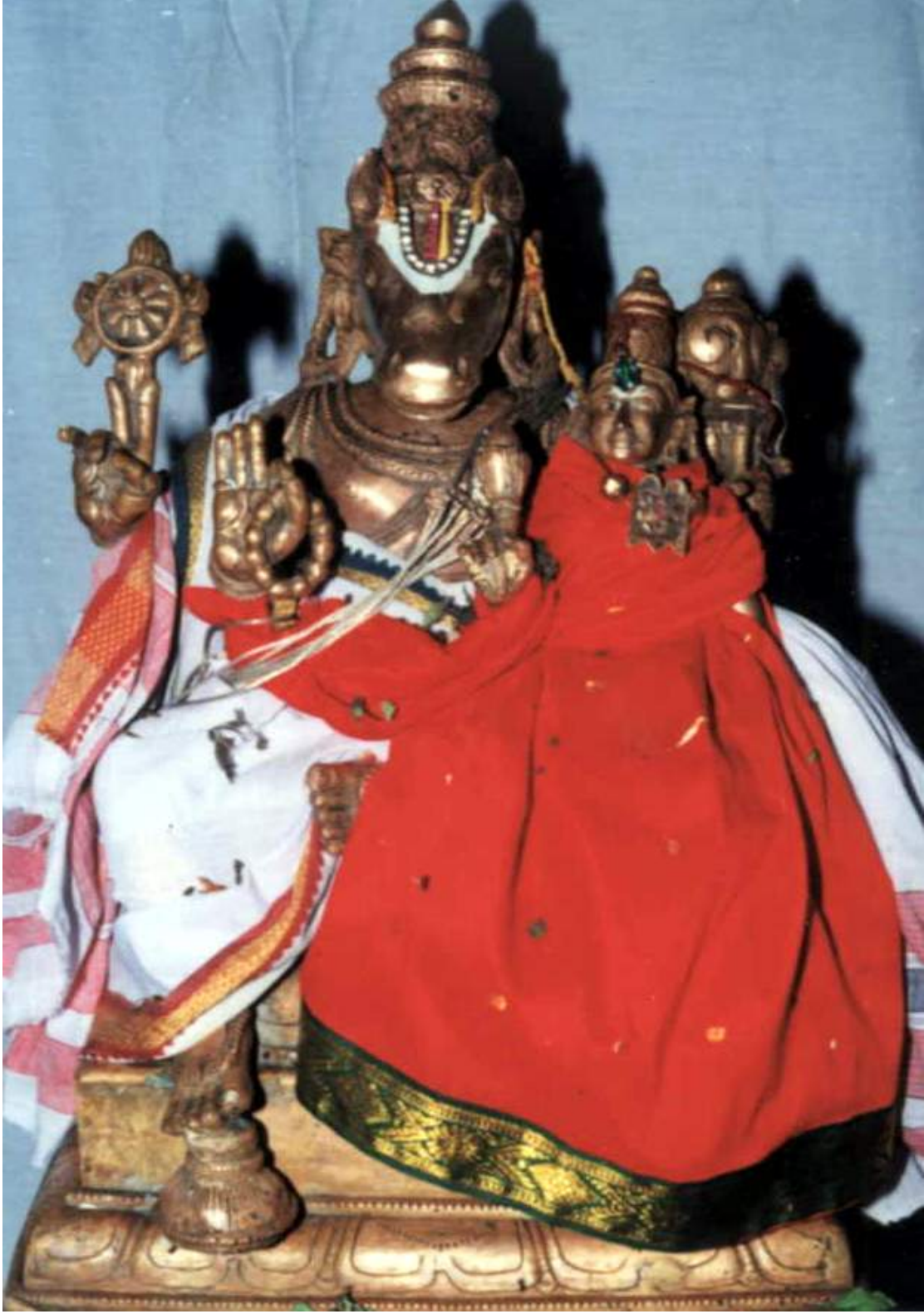
SrI HayagrIvar - Srinivasa Perumal Koil, Mylapore - Desikan Sannidhi