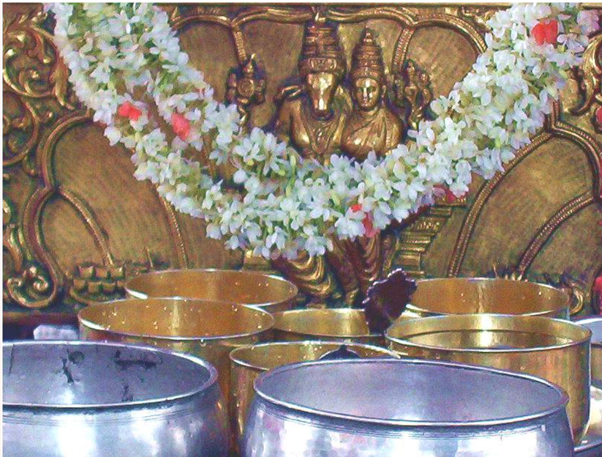
SrI Lakshmi HayagrIvar at the (swing) peeTam