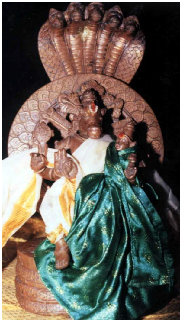
Madipakkam Oppilaappan Koil Hayagreevar