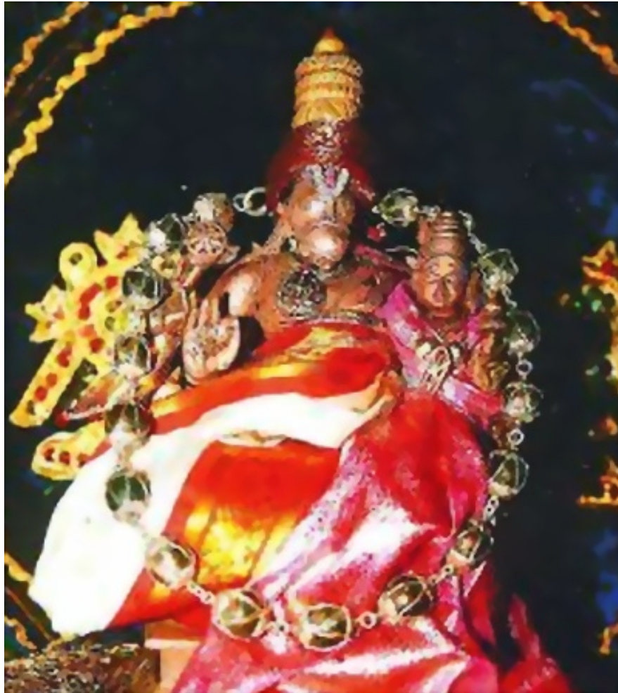
Thuppul SrI Laksmi HayagrIvar

Sri HayagrIva BhagavAn sat on the throne of Swamy Desikan's tongue (JihvAgra SimhAsanam) and helped him to defeat all the contestants in the debates relating to Para Matha Bhangam.