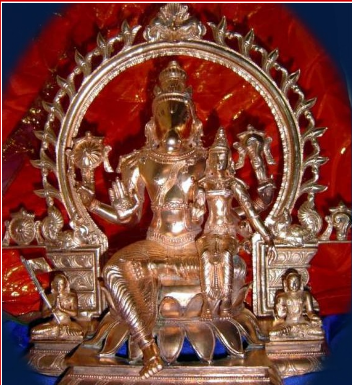
PeriyAshramam Sri Lakshmi HayagrIvar with Sri RAMAnujA and Sri DESika