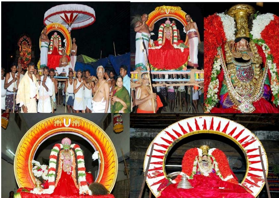
suryaprabhai vAhanam in upper and lower ahobilam

for Him, sUryodayam happened and it looked as though sUryan Himself arrived to witness the splendid vaibhavam of his Lord.