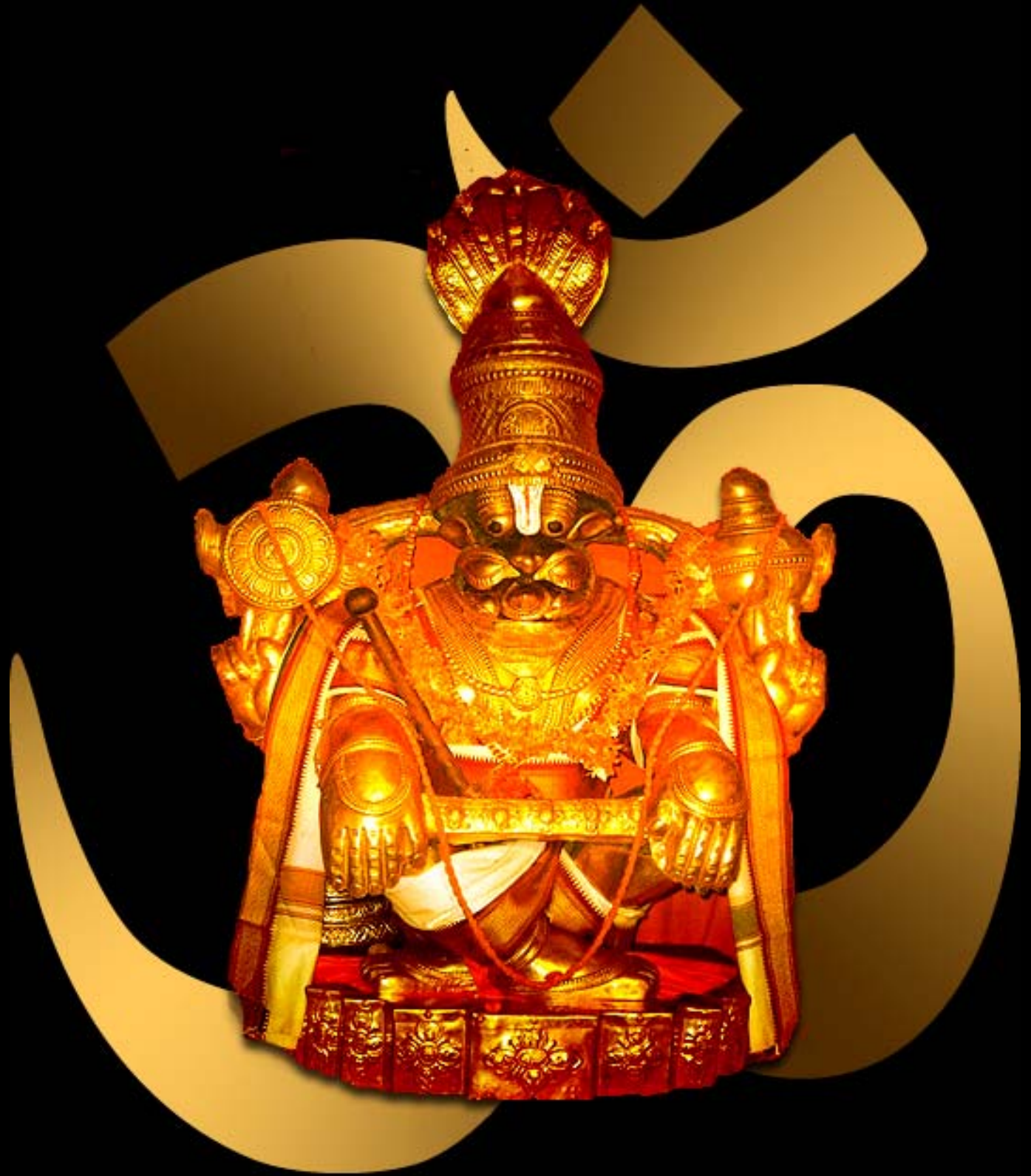
OmKara svarUpan - toNDanUr SrI yoganrsimhar