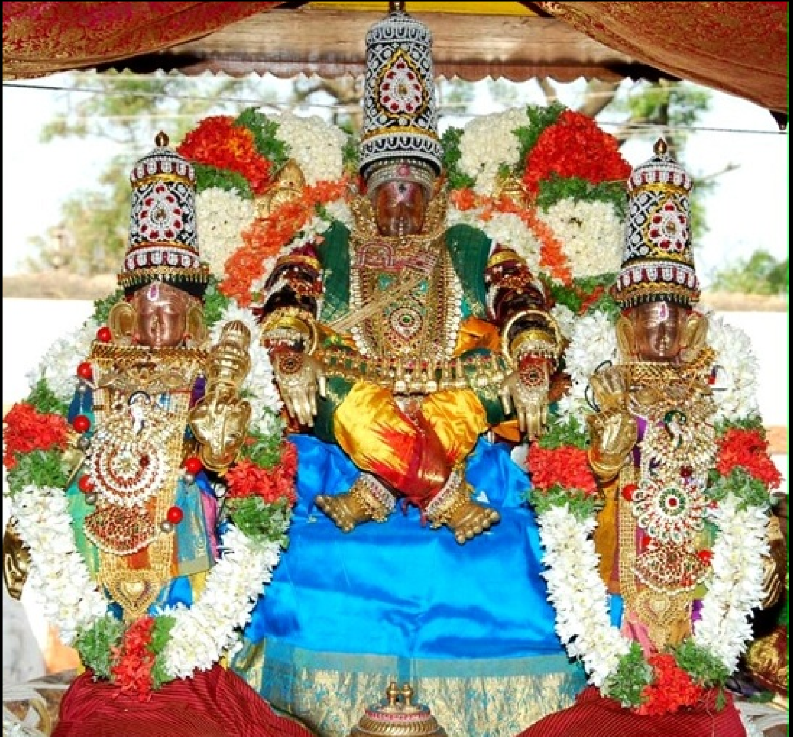
vasanta kumAran! - SrI PrahlAda varadar - SrI ahobilam