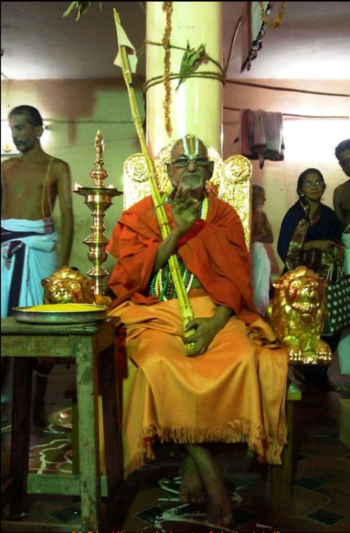
"SrI hari lives in the hearts of the j~nAni-s!" HH prakrtam SrImad azhagiya singar - SrI ahobila maTham