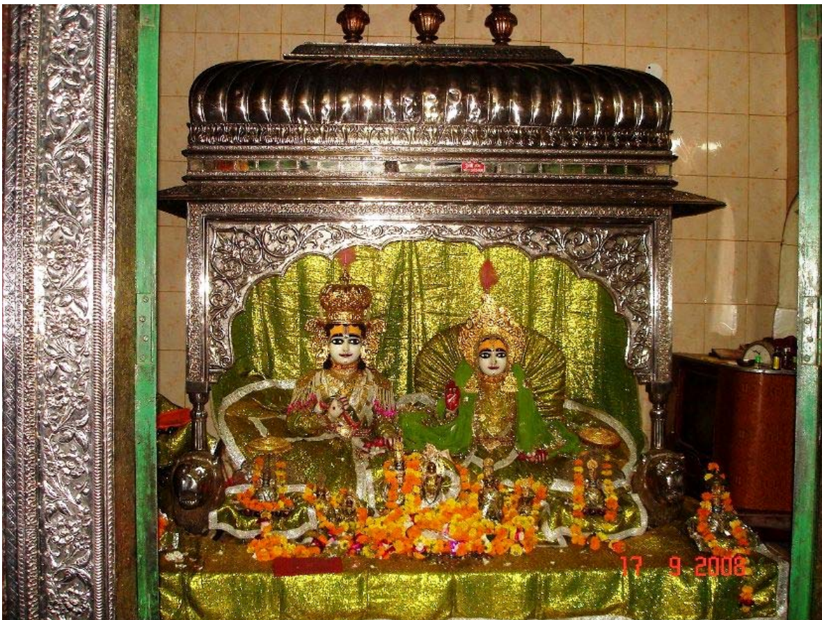
sAketapuri - SrI rAmar and SrI sItA devi at tiru ayodhya

Oh child! You are blessed and Your prayer has become fruitful. hari is under your influence. Why do You worry any more. Please look now at the sky!