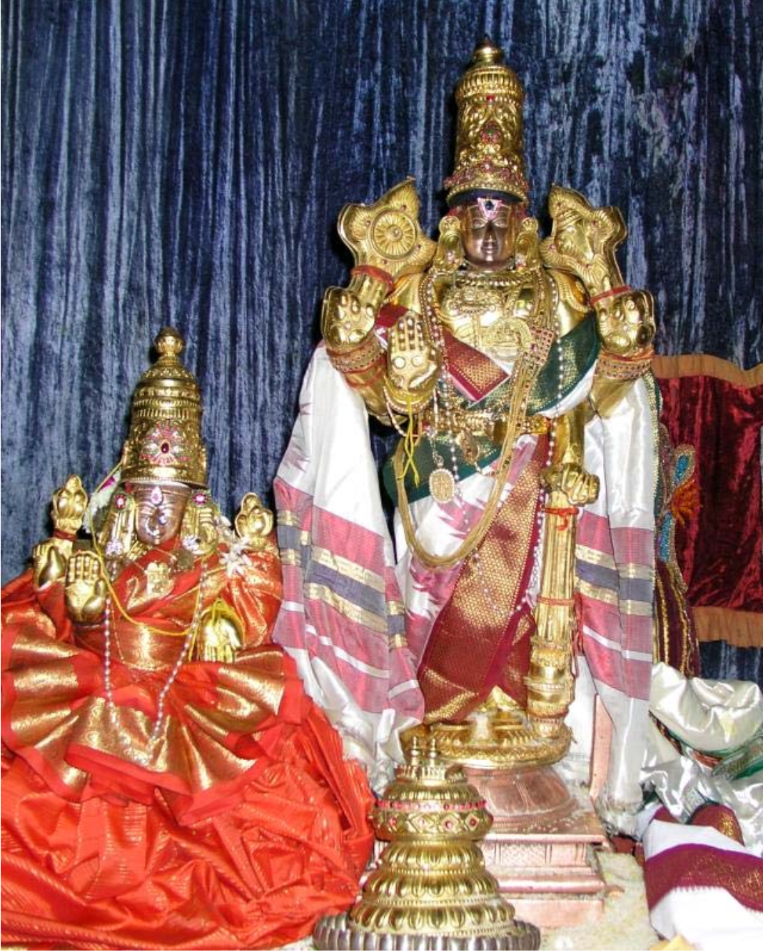
SrI prahlAda varadan with tAyAr - SrI ahobilam

12. nArada muni-- rAgam pantuvarALi, tALam Adi: prahlAdan is overcome with bhakti for his guru, Sage nArada and places his faith in him and prostrates before him.