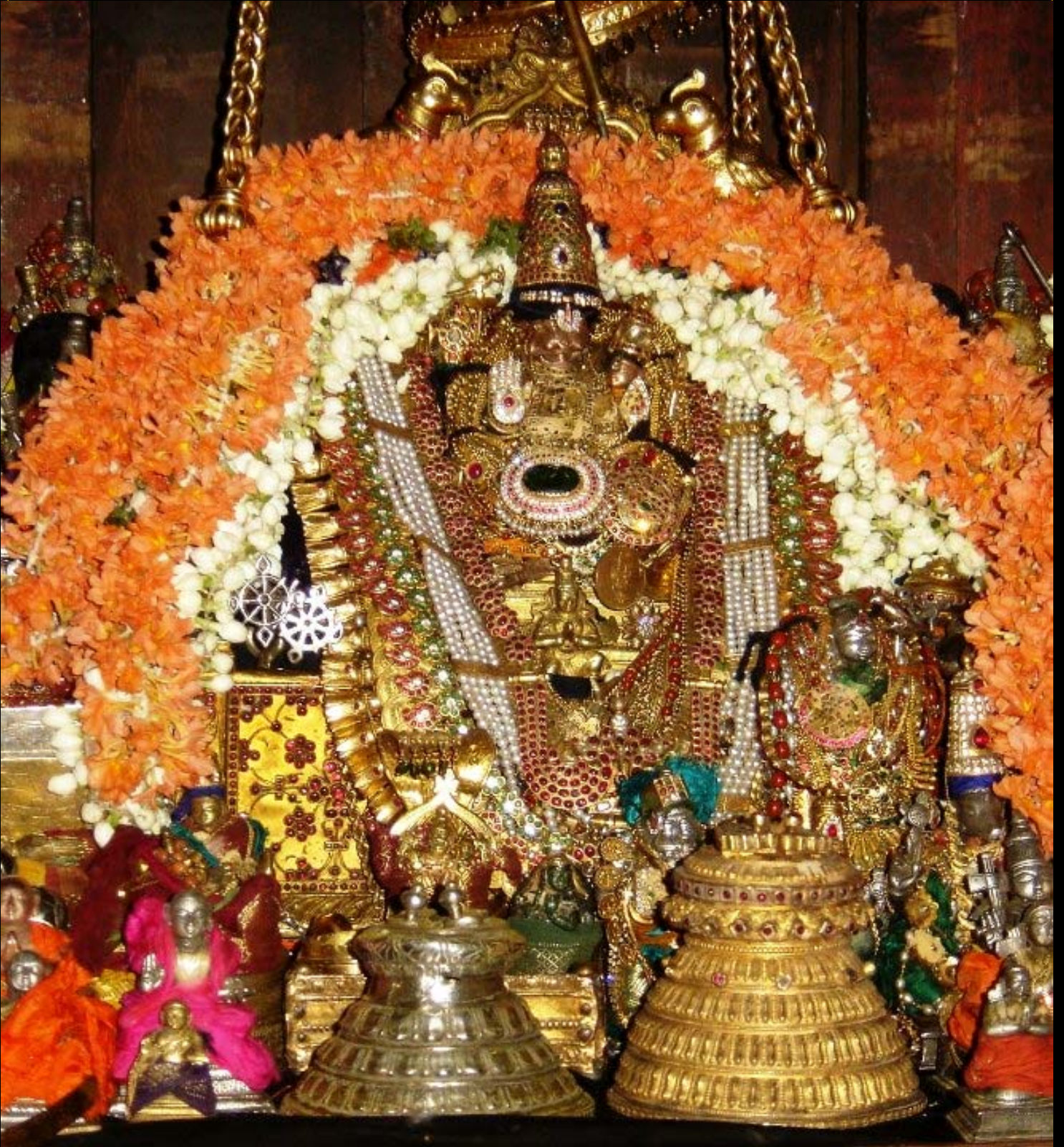
The bhagavAn Who protected bhakta prahlAdan - SrI MAIOlan - SrI ahobila maTham