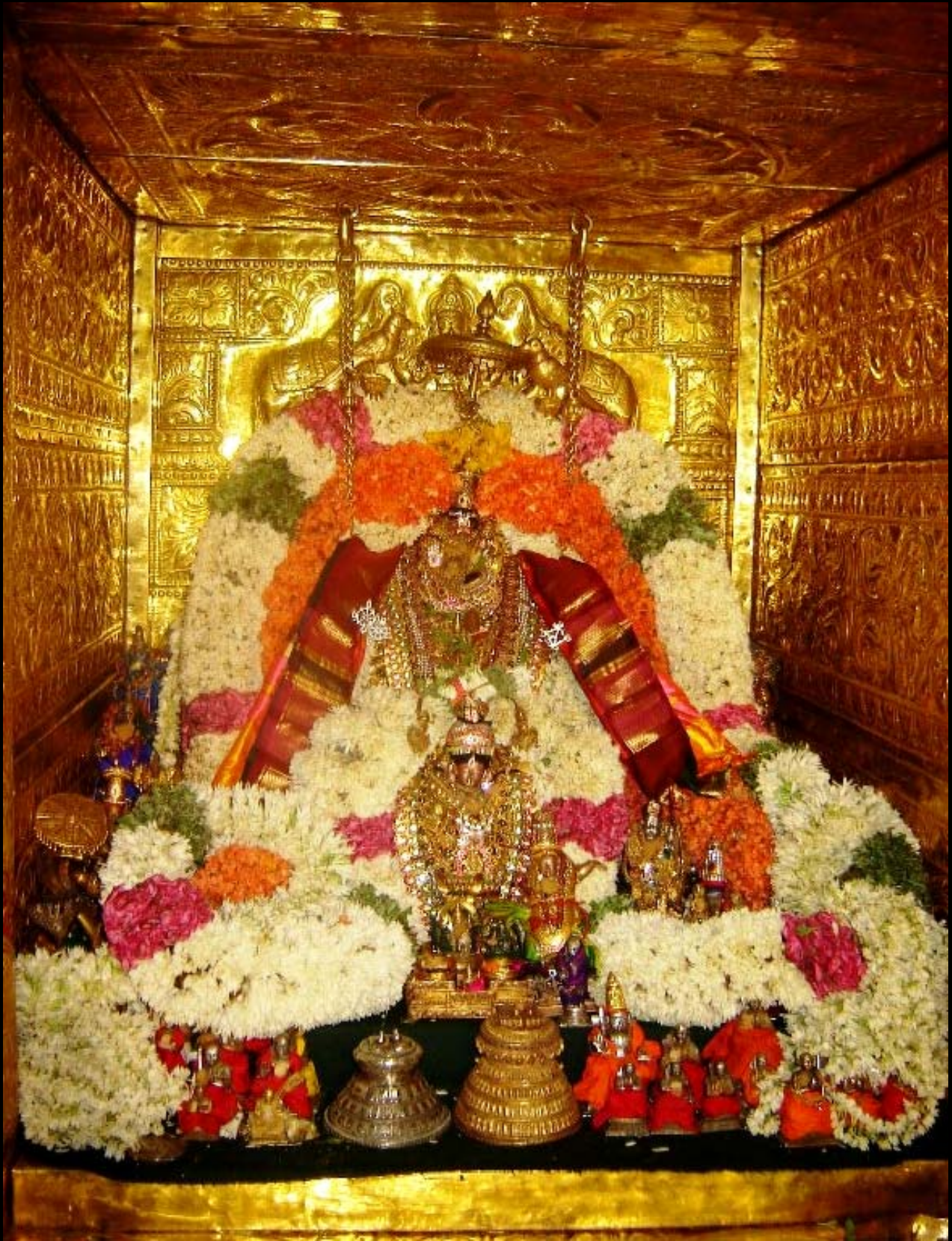
paramapadam on Earth - SrI mAIOla sAmrAjjam