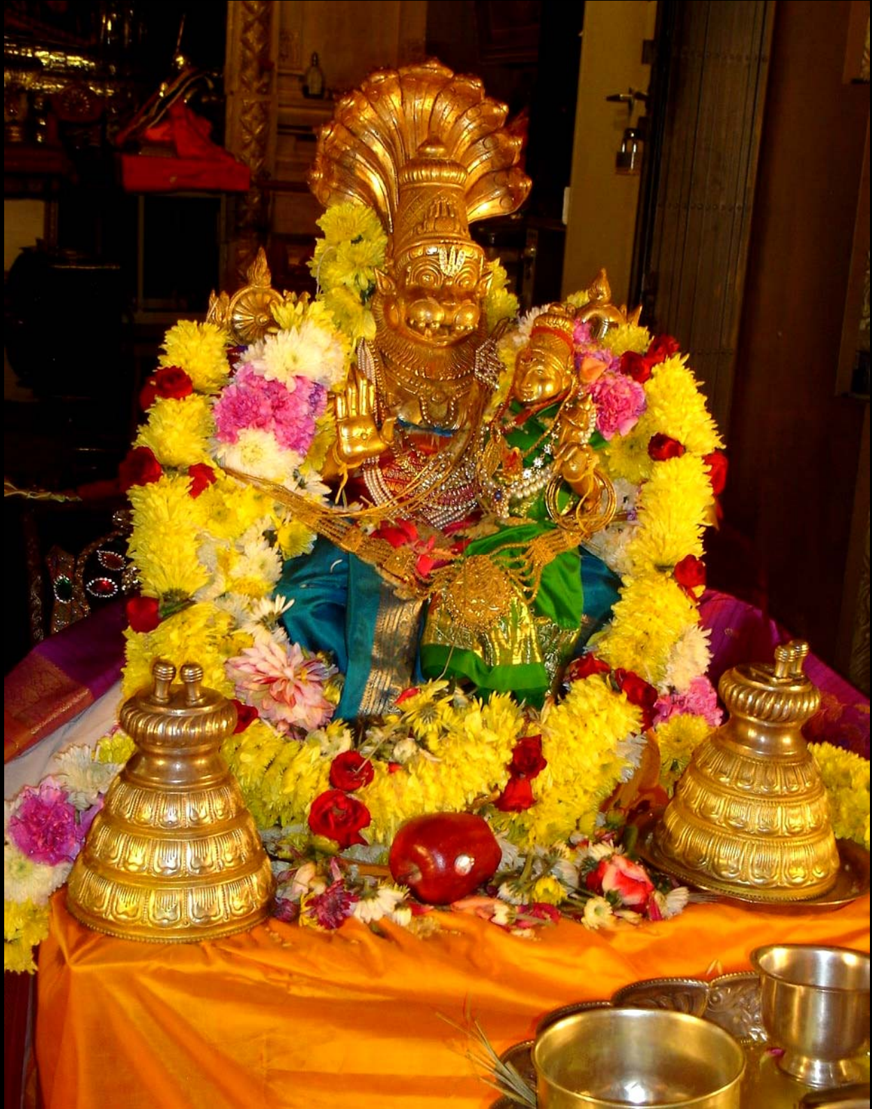
SrI hari with the lustre of kOTi sUryA-s! SrI lakshmInrsimhar (utsavar) at NewYork SrI RanganAtha swAmi Temple