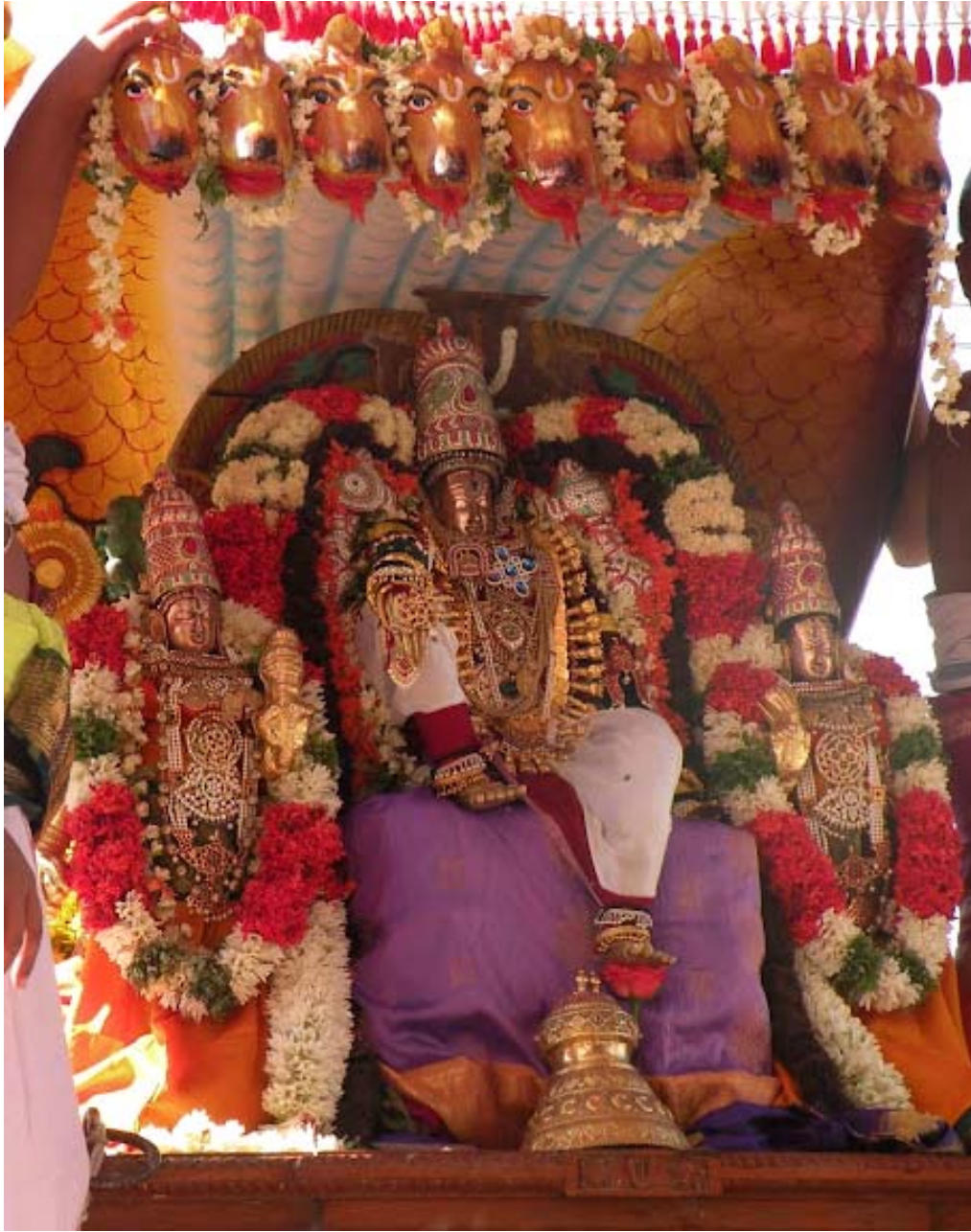
The Ancient Lord! - SrI prahlAda varadar in Sesha vAhanam - SrI ahobilam

ocean and rushed to prahlAdan's side with His shining pItAmbaram and the pearl necklace on His chest moving rapidly and with droplets of sweat forming in His divine face and with the fragrance from the flower garlands following Him, He arrived in front of prahlAdan, the asura child, lifted him up , embraced him and placed him on His lap.