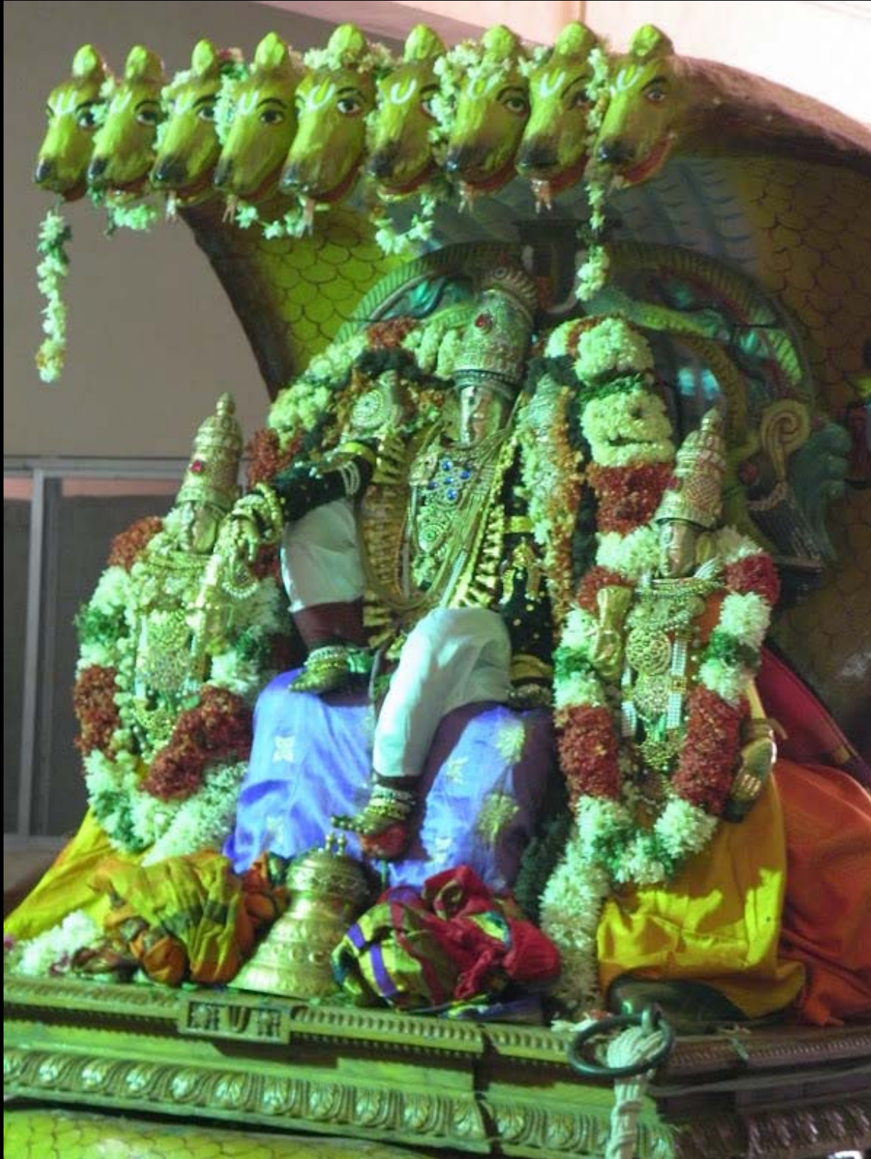
SrI prahlAda varadar with nAccimArs - SrI ahobilaM