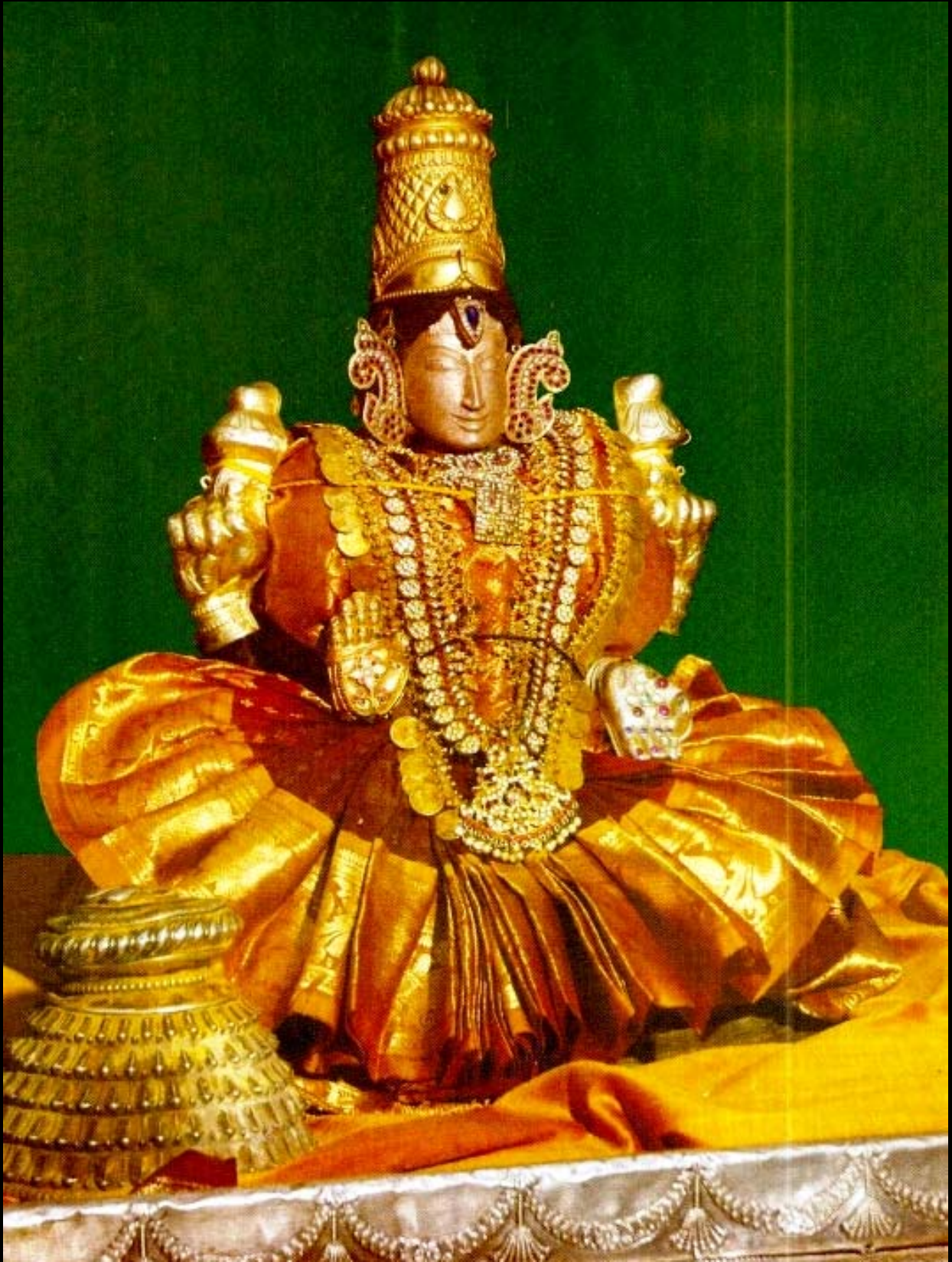
SrI mahAlakshmi - SrI sugandhavana nAcciyAr - tiruIndaLur