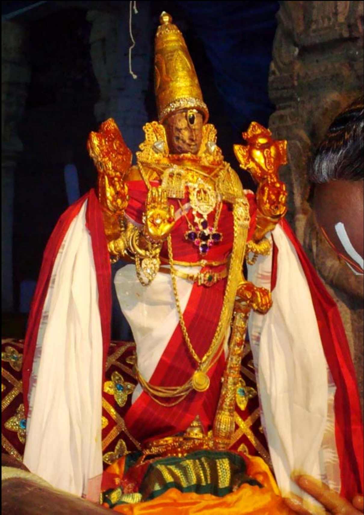
SrI varadarAja perumAl - tirukkacci