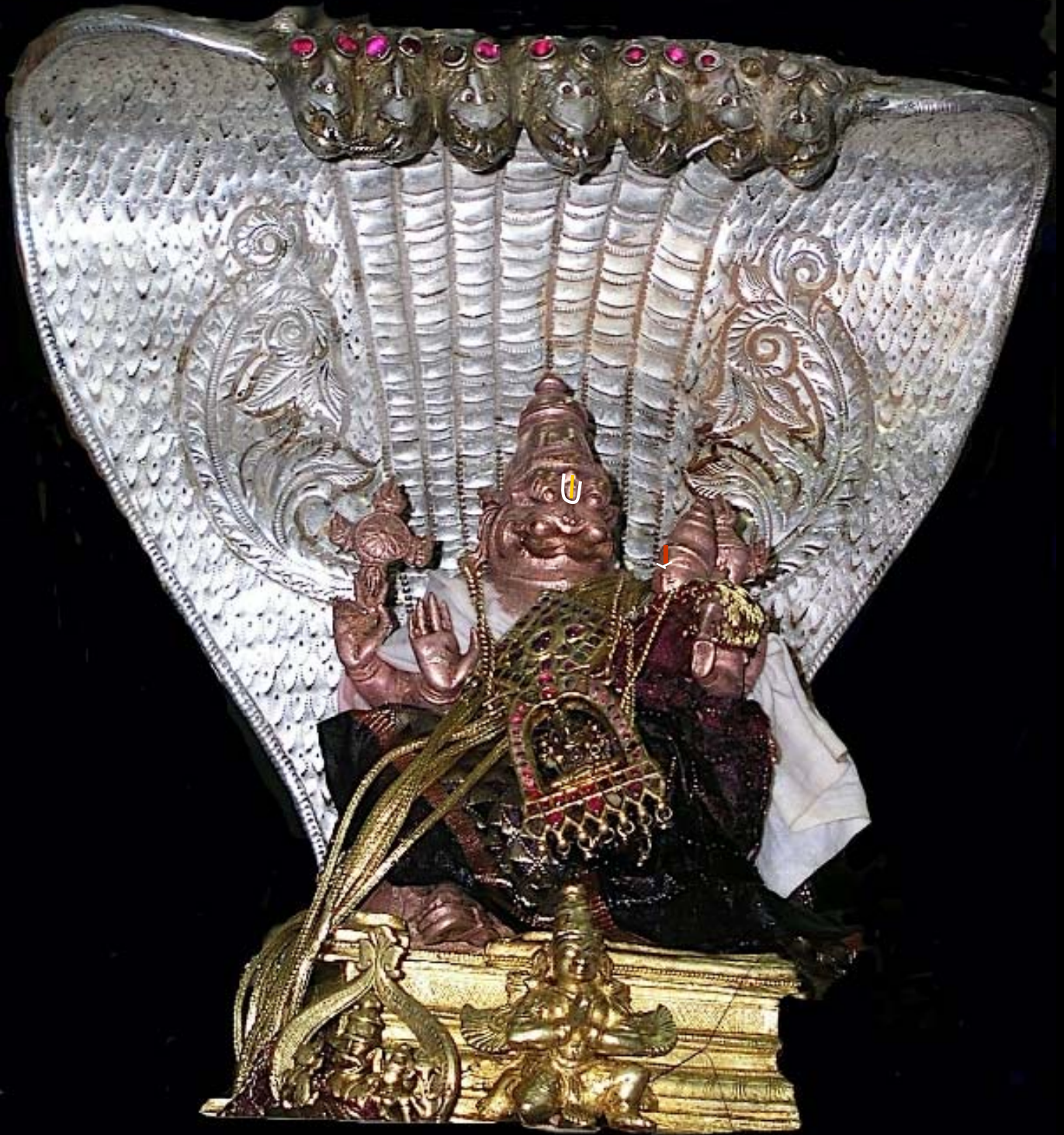
SrI mAlOlan - after thirumanjanam

SrI MAIOlan seated on AdiSeshan - SrI ahobila maTham