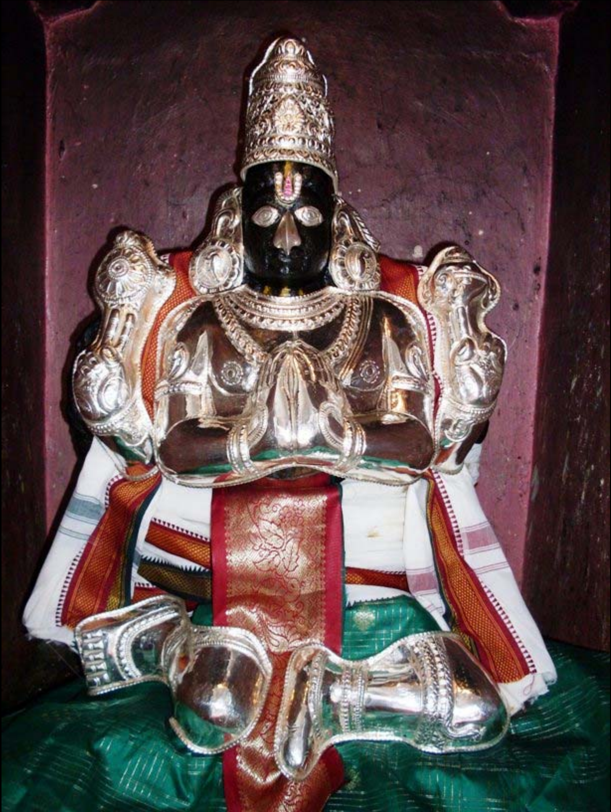
vinatA sutA - SrI garuDazhvAr at tiruveLLiyankuD