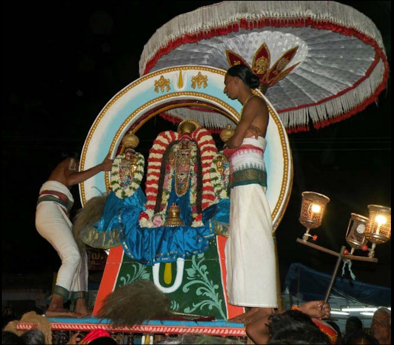
The Lord of SrI bhUmi devi! SrI prahlAda varadar on candra prabhai vAhanam - SrI ahobilam