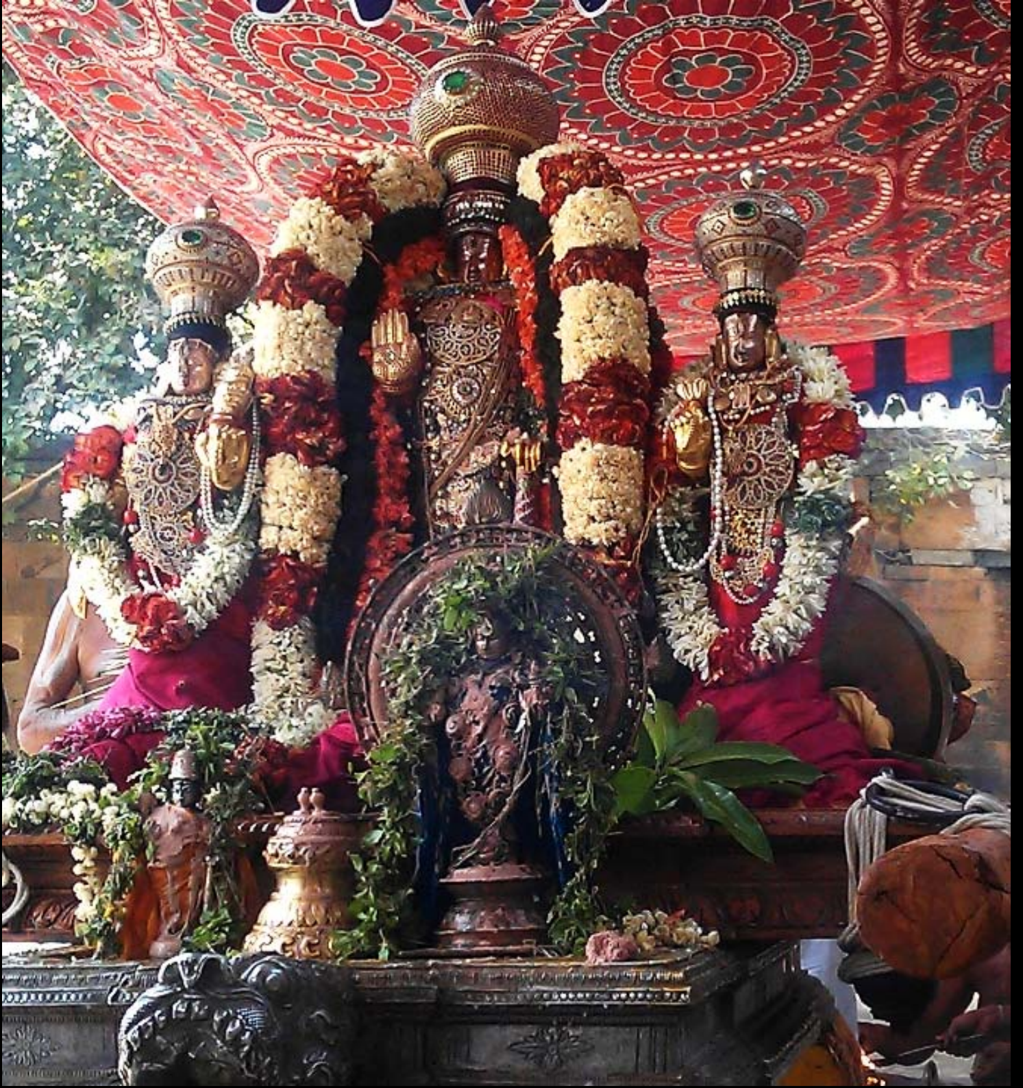
avApta samasta kAman! - SrI prahlAda varadar with ubhaya nAccimArs- SrI ahobilam