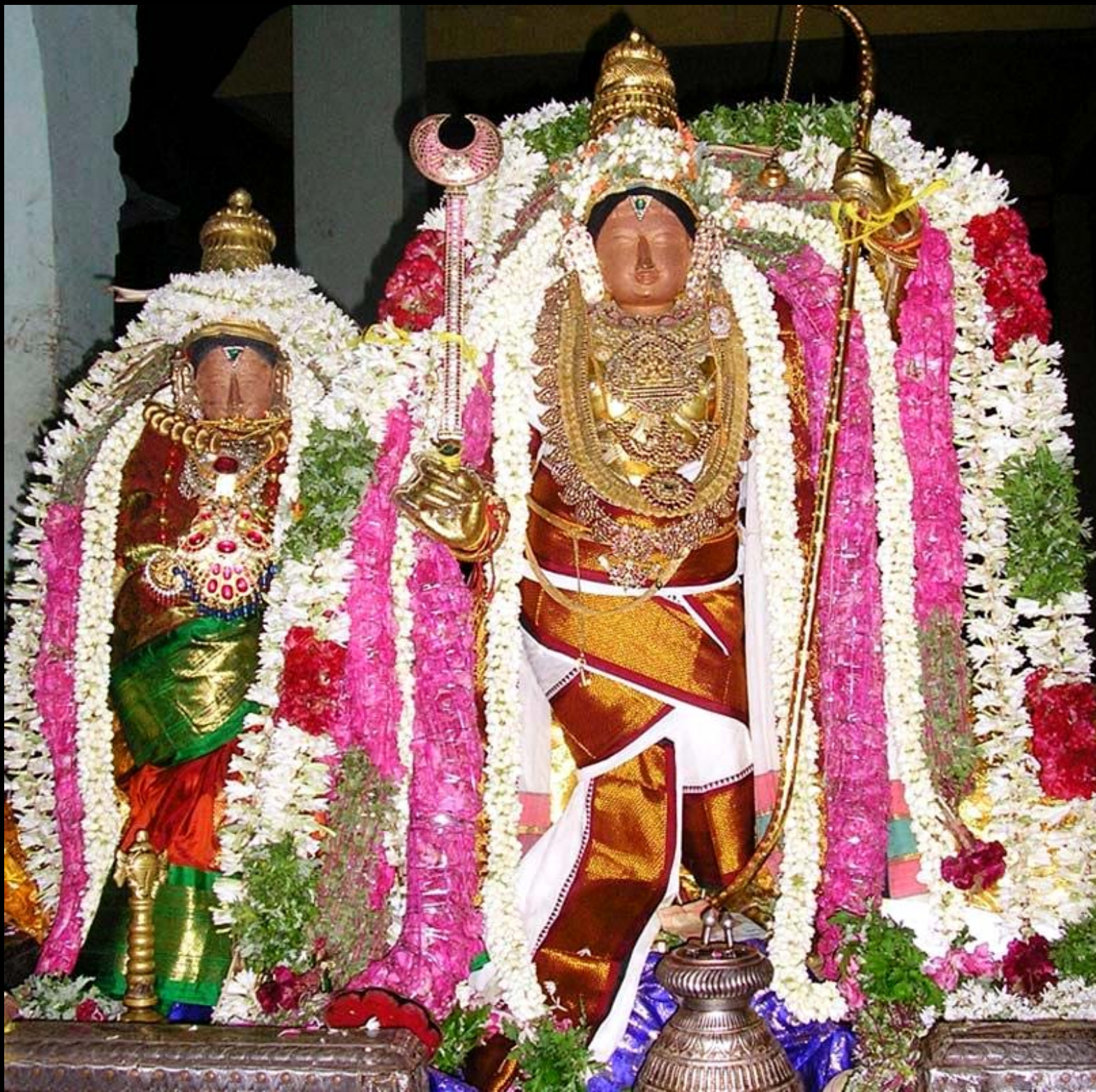
The Lotus eyed Lord! - VaDuvUr SrI rAmar and tAyAr