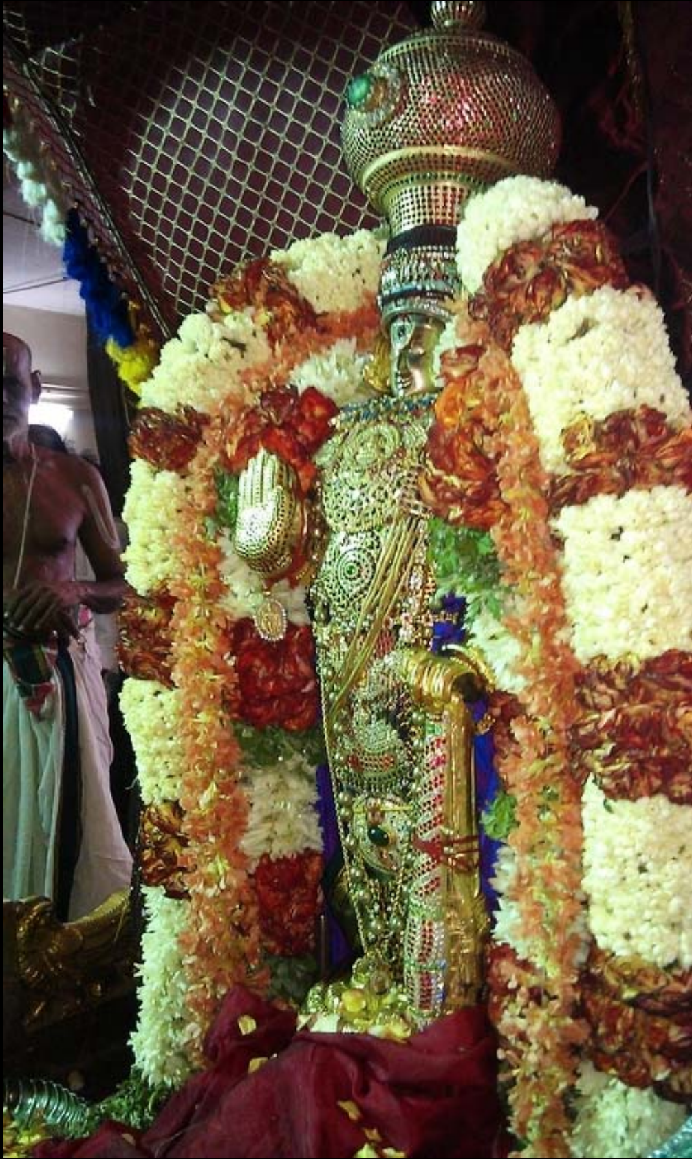
The most beautiful Lord! - SrI prahlAda varadar - SrI ahobilaM