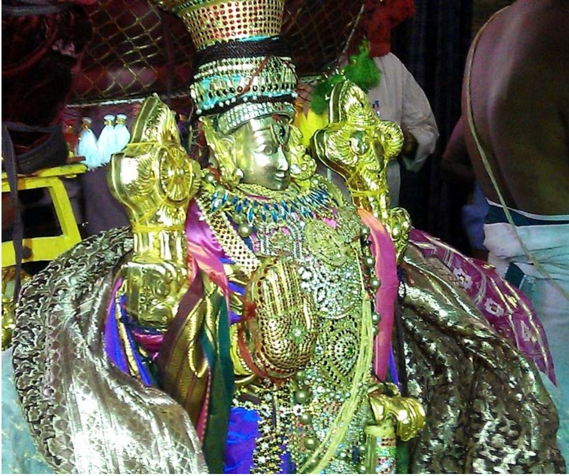
The Beautiful Lord! - SrI prahlAda varadar - SrI ahobilaM