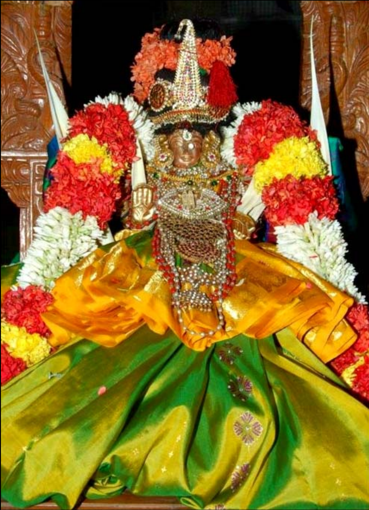
"Hail to the Lord of SrI mahAlakshmi!" - SrI cenjulakshmi tAyAr SrI ahobilaM