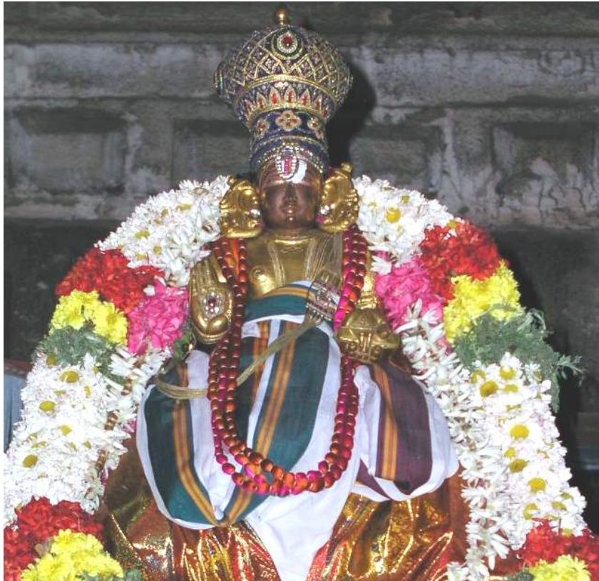
“Swamy Desikan – Kaanchipuram”

Swamy Desikan had ascended the AchArya Peetam at a young age after His own AchAryan ascended to Parama Padham. Swamy was at Kaanchipuram and sustained himself and his family with Unchavrutthi. Most of his time was spent in interpreting scriptures and performing KaalakshEpam to his sishyAs. He spurned wealth and led a simple and contented life. He visited Lord VaradarAjan sannidhi every day and had theertham and SaThAri before performing Aaradhanam at his own house. Swamy