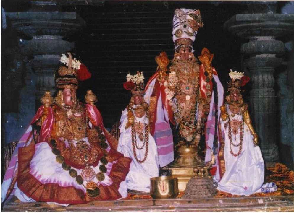
Lord VaradarAjan of Atthigiri, Kanchi