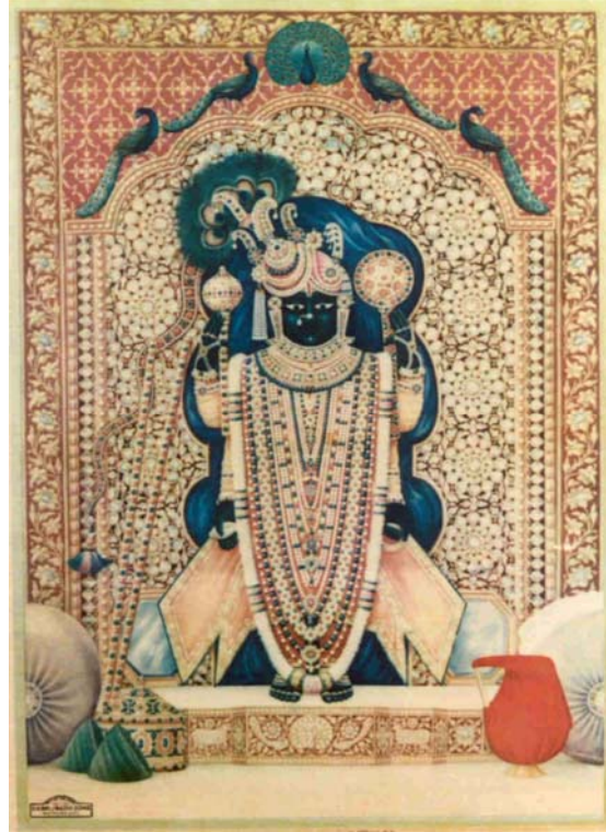
“kuchEla visited Srikrishna in Dwaraka – Picture of Dwarakanathan”

kshONee kONa SathAmsa paalana kaLA dhurvAra garvAnala- kshubhyath kshudhra narEndhra chADu rachana dhanyAn na manyAmahE dEvam sEvithumEva niscchinumahE yOasou dayALu : purA dhAnA mushti muchE KuchEla munayE dhatthEsma vitthEsathAm