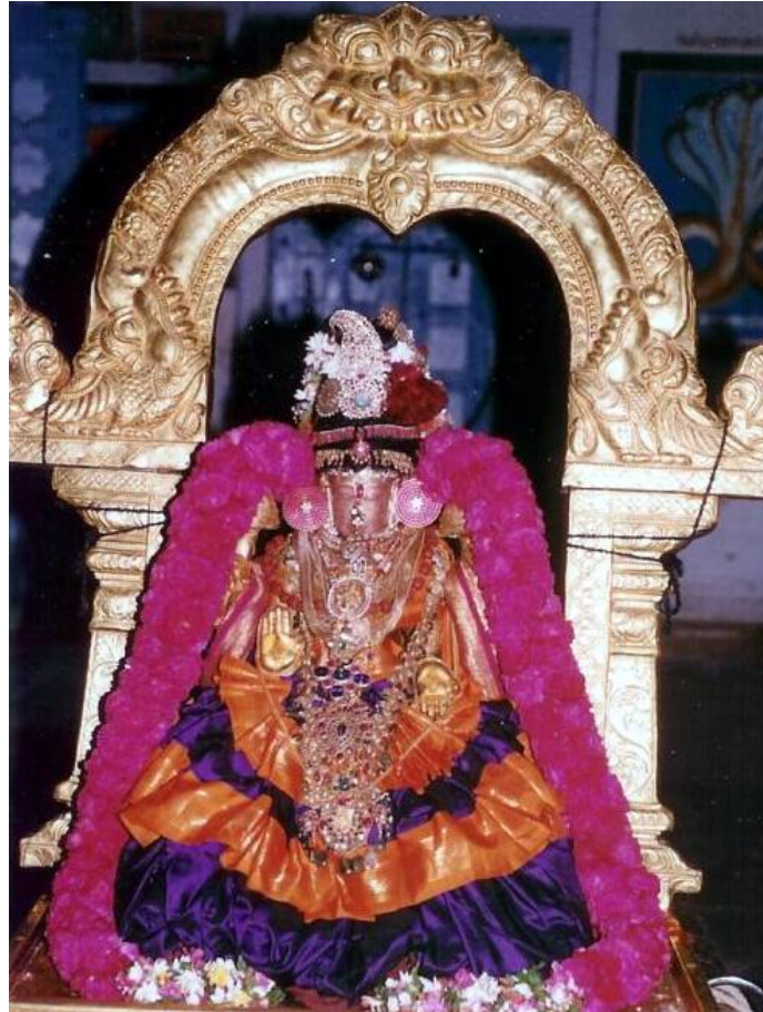
"The Lord's Chief Wealth"